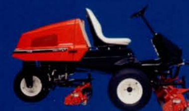
Walk-through deck allows easy entrance and exit from either side.