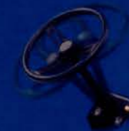
Standard tilt wheel and power steering.

KILPATRICK TURF EQUIPMENT NAPLES - (813) 333-8086 FT. LAUDERDALE - (305) 792-6005