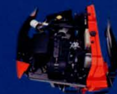
Easy access to battery, radiator, coolant bottle, air filter, hydraulic fill and fuel fill.