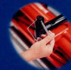
The patented FlashAttach system makes Greens King V the most versatile machine around.