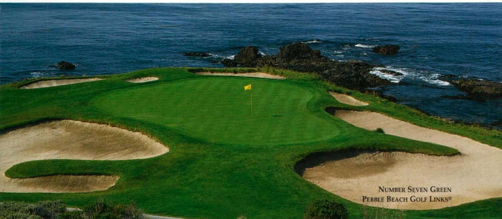
NUMBER SEVEN GREEN PEBBLE BEACH GOLF LINKS®