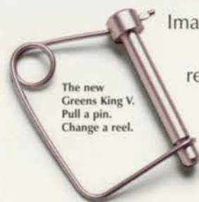
The new Greens King V. Pull a pin. Change a reel.

Imagine switching from 11-blade reels for greens to 7-blade reels for tees in about 30 seconds. Now imagine doing it without tools.