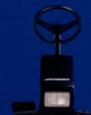
Standard halogen headlight offers visibility at dusk and dawn.