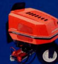
Fully enclosed engine for quieter, cleaner operation.