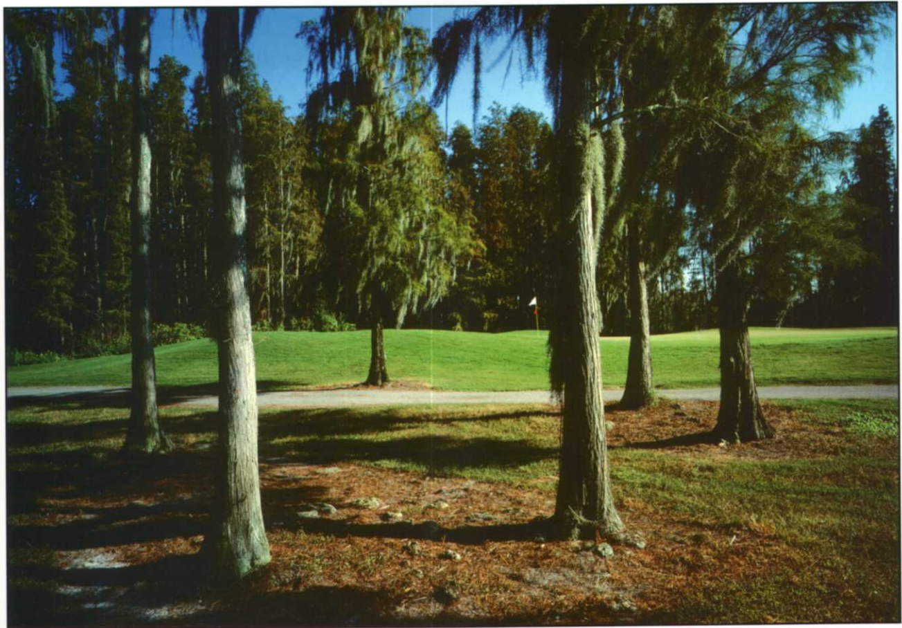
Saddlebrook Course. Cypress trees flank the 8th green.