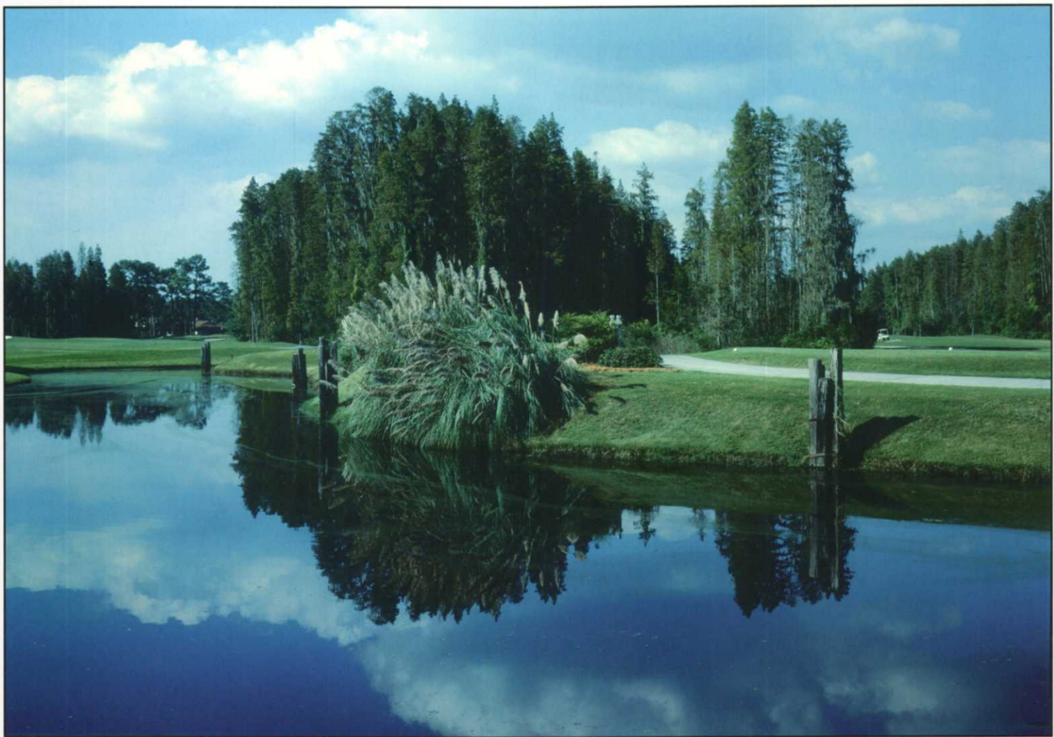
Saddlebrook Course. Pampas grass and pilings accent the first tee.