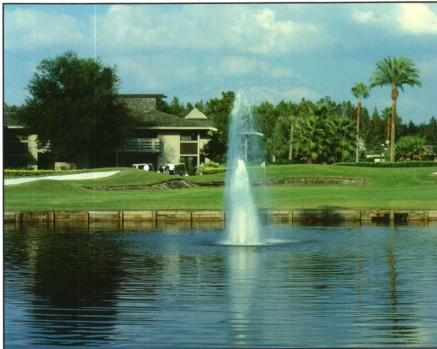
Saddlebrook Course. The 18th green sports a fountain and a unique application of railroad ties.