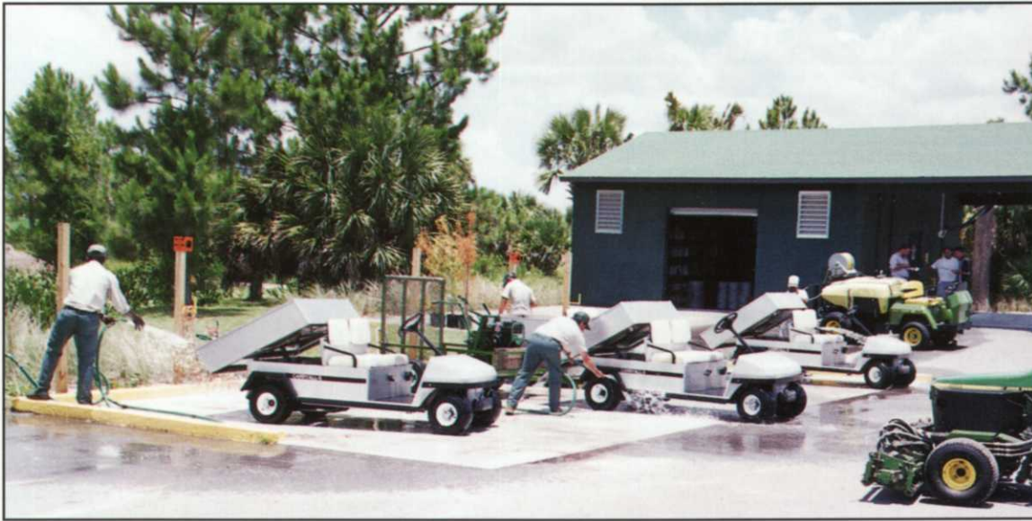
Left, a 40 x 20 ft. wash area with multiple air and water stations. In photo below, the sumps are emptied daily and the collected solids are spread on the course.

The second chamber that is formed between the two walls functions as an oil/water separator. The second wall extends from the top of the tank and does not extend the full distance to the bottom. Therefore, it creates a chamber that would contain oil, since oil will always float on water. The water then flows under the second wall into the third chamber.