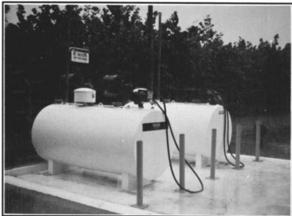
Orchid Island G.C.

* "Get a good, reputable tank company . . ."