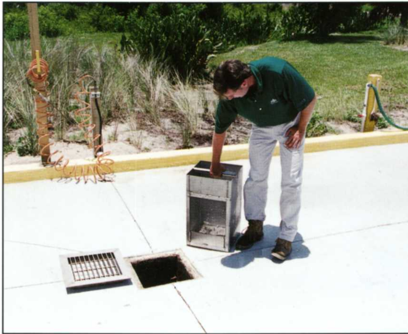
One of three removable sumps on the wash pad