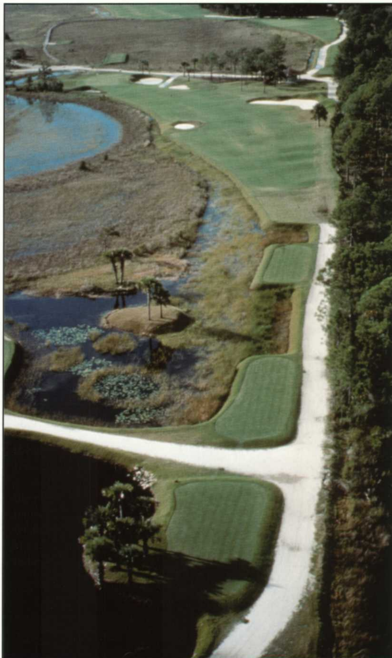
Pete Dye manages water at Old Marsh with unique design features.

One design feature that each hole has is that all the perimeters of the fairways and roughs are built higher than the middle of the fairways to ensure no fertilizer or pesticides contaminate the wetlands. We are very selective on our use of products, and try to be environmentally conscious.