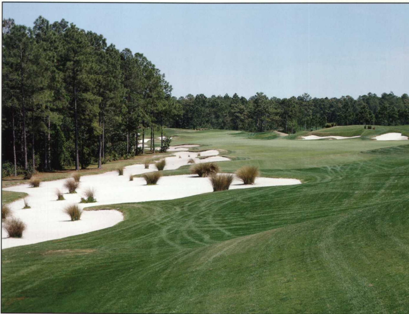
Osprey Ridge #14, par 4. Bunkers and ridges.