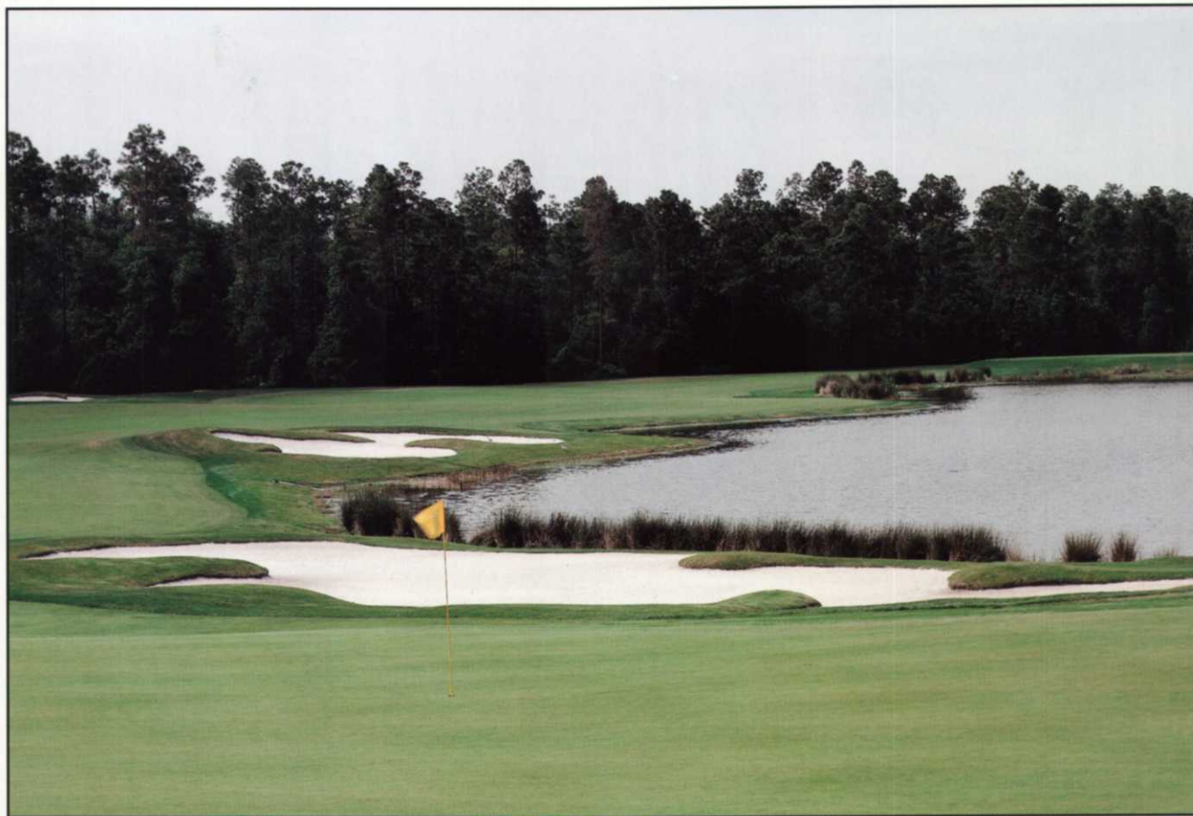
Looking back down #14, Osprey Ridge, a tough par 4.