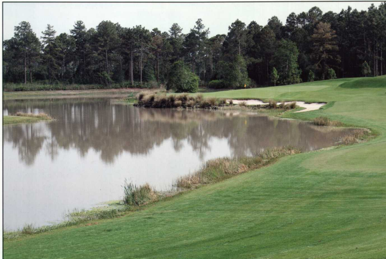
Osprey Ridge #17, a two-tiered challenge.