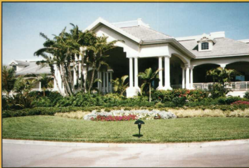
Category 2a 2nd Place (left) - The Sanctuary Golf Club