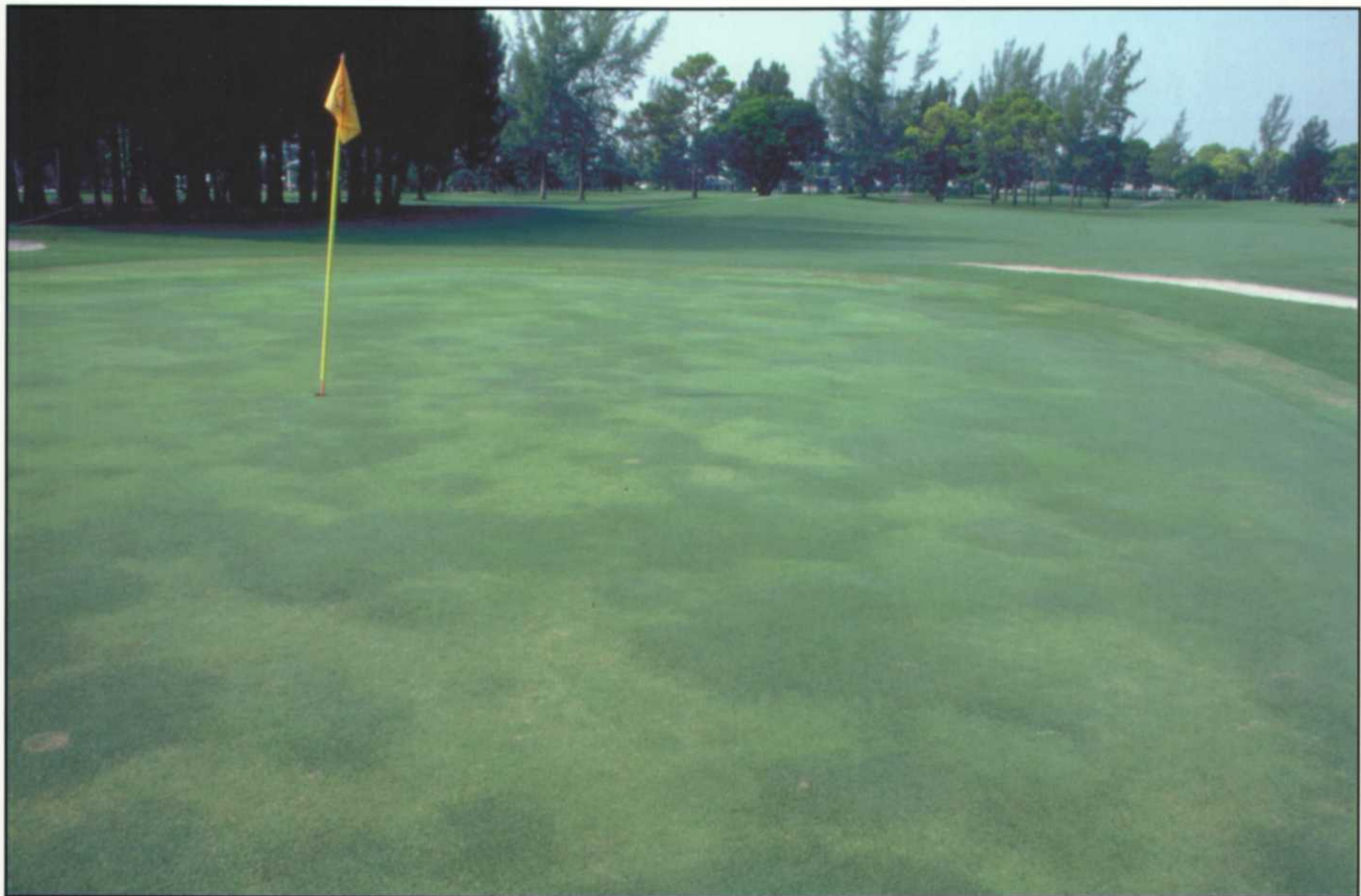
Repeating occurrence of bermudagrass genetic off-types on a Florida green reduced the putting quality.