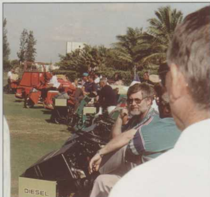
Participants review turf plots at the FGCSA-funded research greens

Fort Lauderdale Research and Education Center which was the sight of the Expo again this year.