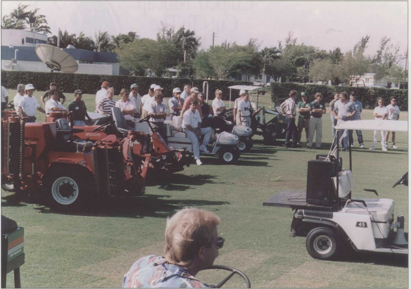
A beautiful, sunny mid-spring day welcomed Expo attendees to a great day of education and fellowship. Equipment demonstrations, below, provided by the Expo gave helpful insights into the special features and abilities of the units present.