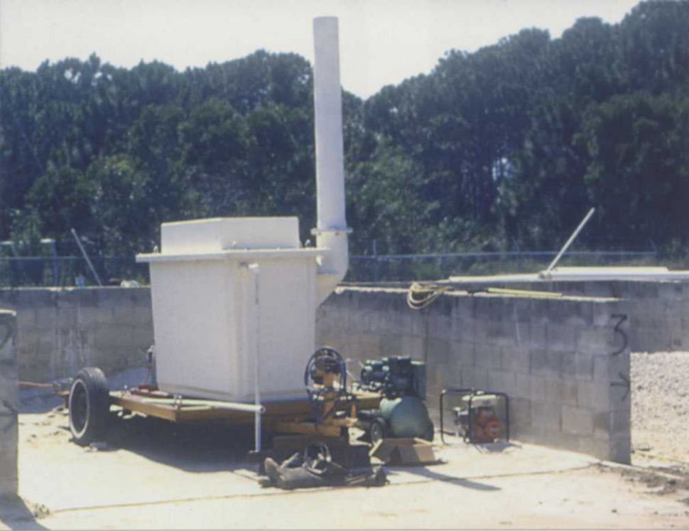
Contaminated groundwater requires special equipment like this stripping tower to remove residual material.

The landfarm was plowed five or six days per week for many months. The financial savings made the work worthwhile and I would recommend the technique to anyone who has the acreage, the labor pool and the time. As I said earlier, landfarming saved us at least $30,000 over the cost of trucking the soil to an incinerator.