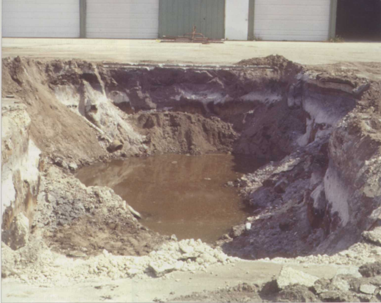
This pit, which once housed underground storage tanks, became known as "the swimming pool" during the decontamination process.

I still had a huge hole in my shop complex that was a constant liability. Every night before we went home, we parked all of large equipment around the hole and wrapped the site in yellow warning tape in case someone were to get within our fenced shop area.