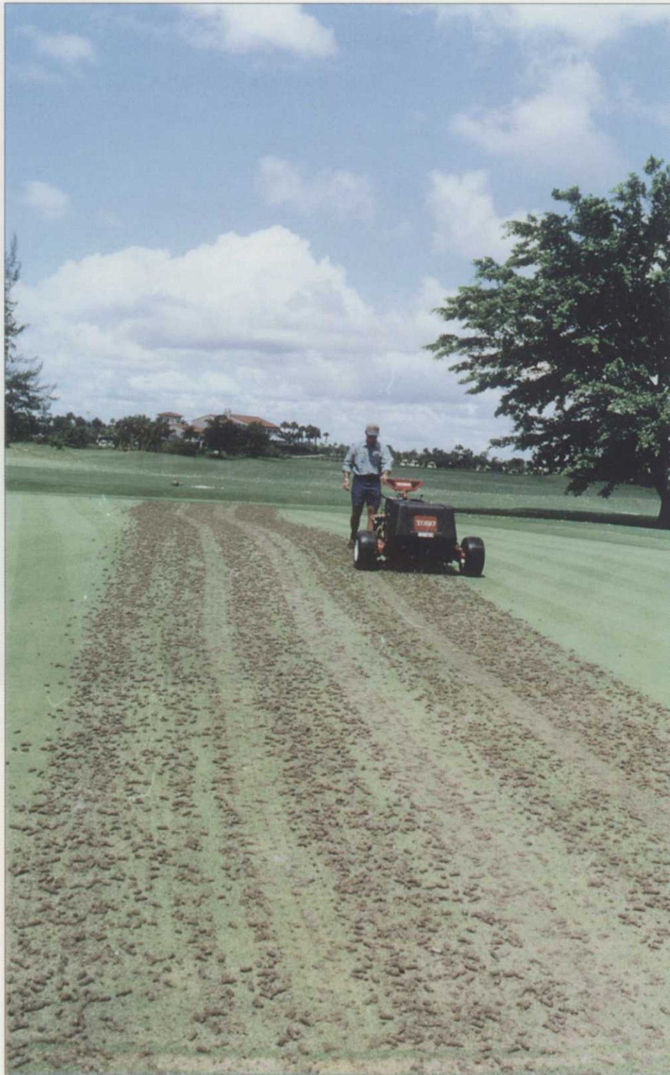
Mechanical removal of winter grass by means of aerification will help the bermuda base recover quickly.

This "wild day" is successful because the work gets done all in one day, result-