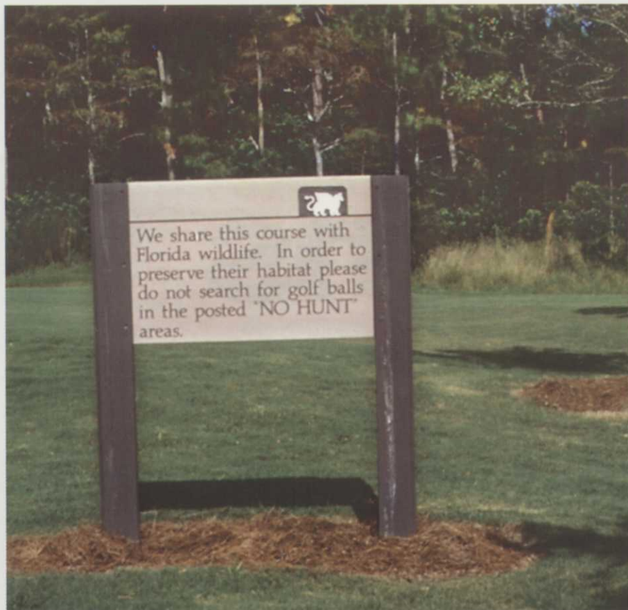
Sign announces a no-hunt area as part of wildlife protection program at Gateway GC in Fort Myers is part of a "public involvement" project.