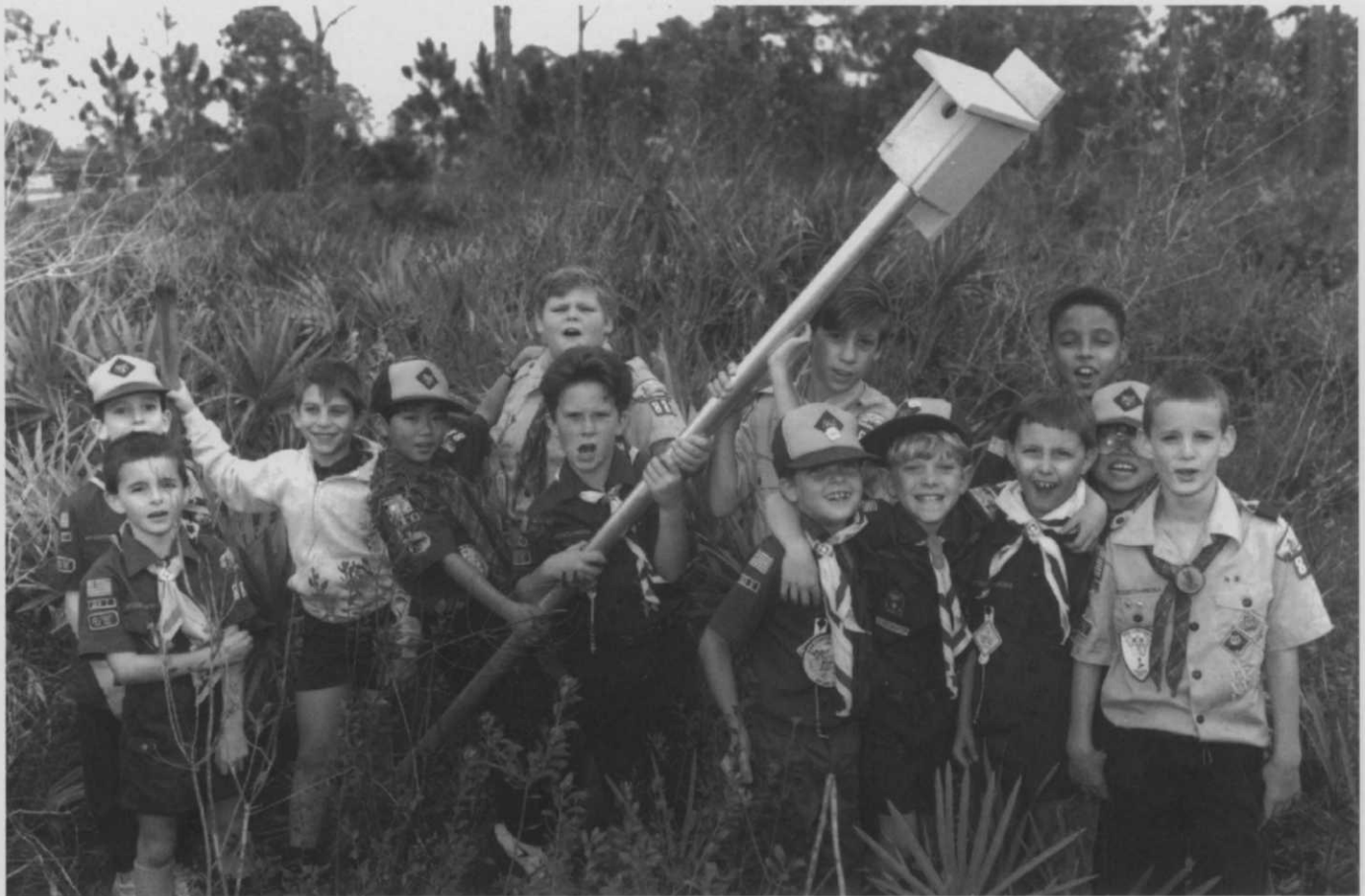
Members of Martin County Cub Scout Pack 888 took part in a nest box project at Summerfield GC in Stuart.

and support they deserve, increase golfer understanding of wildlife and environmental quality on the golf course, and let the public know that golf courses can be valuable community resources — whether or not the public ever gets to step on the course.