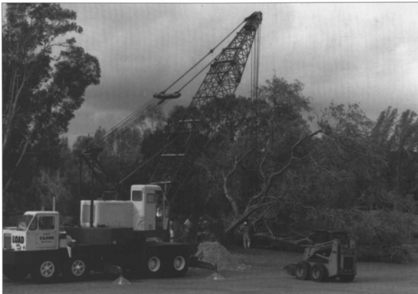
A 40-ton crane is used to lift a fallen oak tree at Don Shula's Hotel and Golf Club, Miami Lakes.