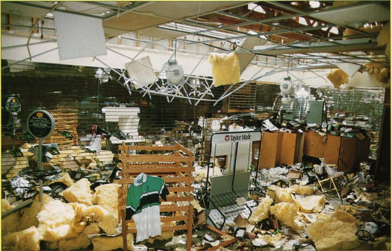
The pro shop at Falcon Fairways GC at Homestead Air Force Base, above, was left in terrible shape by Hurricane Andrew. Below, Miami Palmetto Golf Course shows how firm a golf ball was lodged in a palm tree. How it was put there, by a golfer or the hurricane, is unknown.