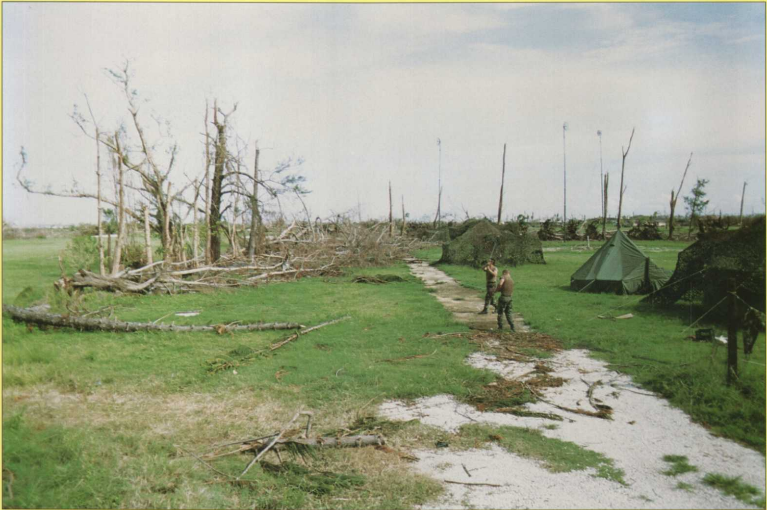
Falcon Fairways GC at Homestead Air Force Base, an 18-hole course for military personnel, was the only course permanently closed as a result of Hurricane Andrew.