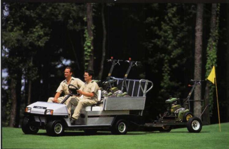
Carryall II Plus