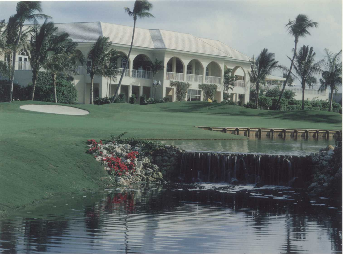
The 18th green, with the clubhouse in the background, presents a tranquil setting for a finishing hole from this vantage point.

...it may even become a crisis... I think we may be pumping out too many turf students right into superintendent positions.