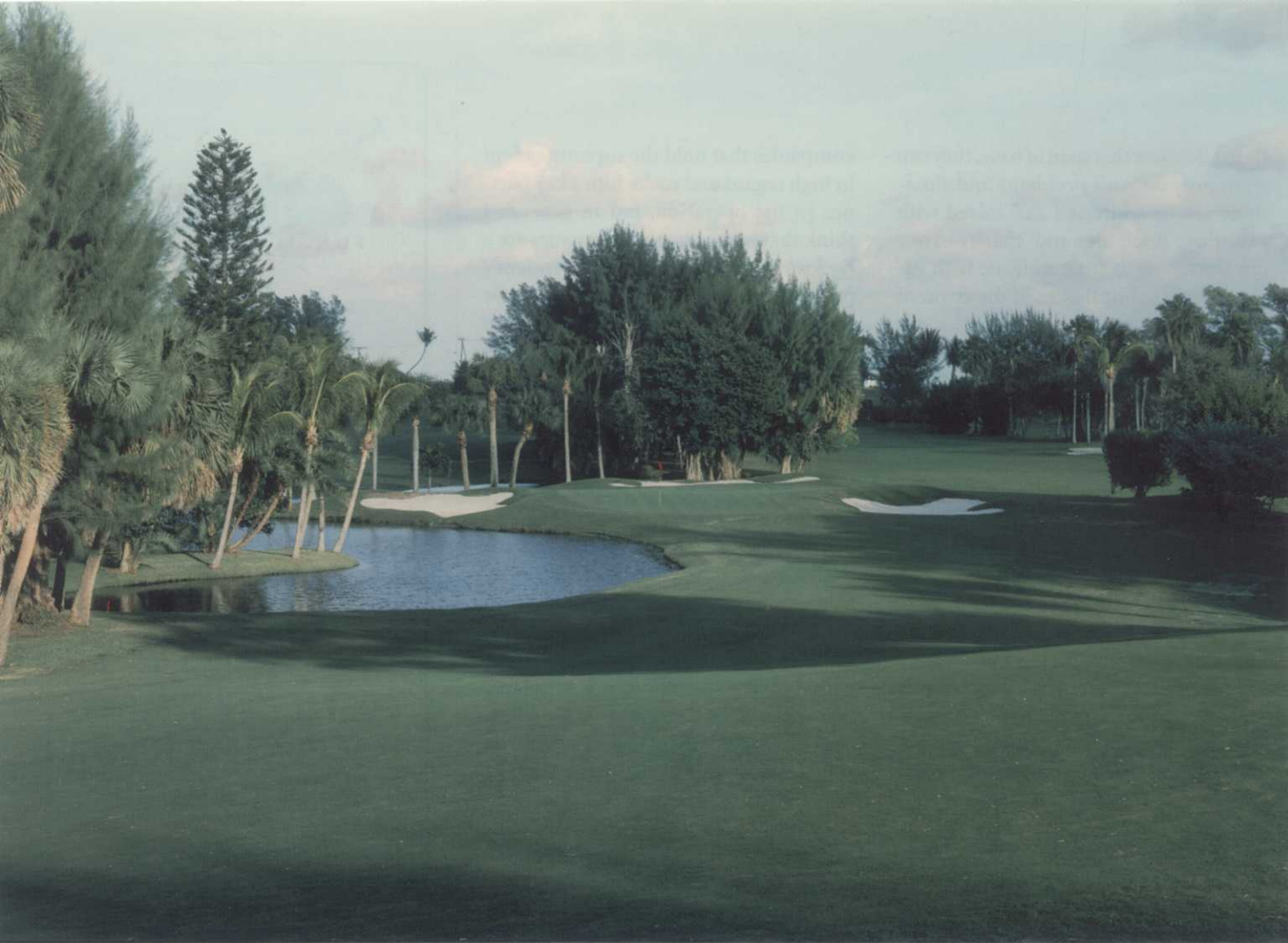
The strategic elements of a Donald Ross design are evident at the par-three number 12.

It continues to blow my mind that we only have 750 A and B members out of more than a thousand golf courses in the state.