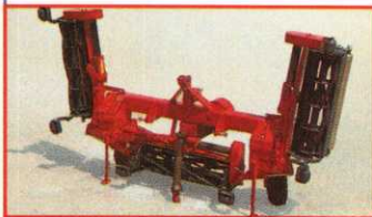
Rear mower assembly detached