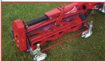
Fixed cutting unit, with anti-scalp rollers.

Hydrostatic transmission, diesel, Kubota reliability