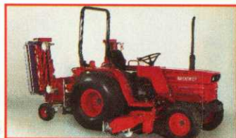
Finger-tip controls for easy fold-up and transportation