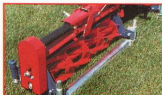
Floating cutting unit with front roller