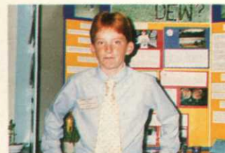
Youth turns Florida Green article into successful science fair project ..... 68