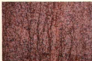
FTGA officials hope to get to the root of some problems with a rhizatron ..... 56