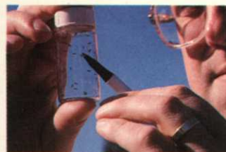
University of Florida scientists find a tiny wasp that's deadly on roaches ..... 66