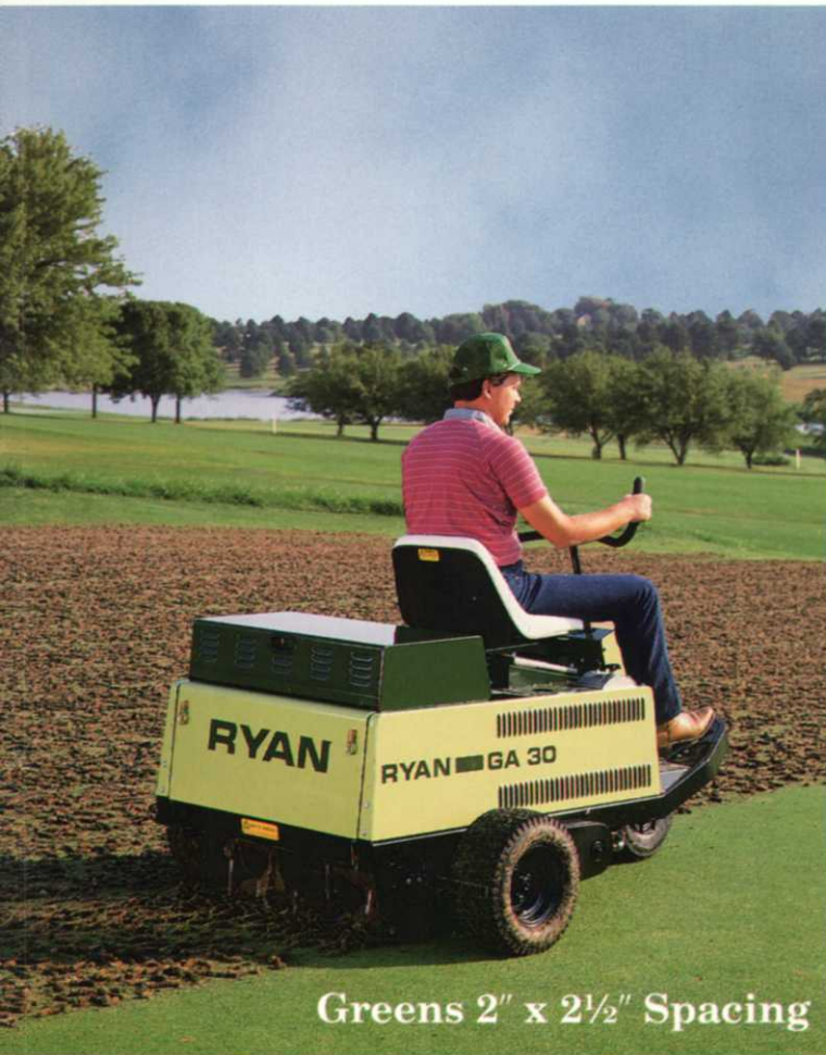
Greens 2" x 2½" Spacing