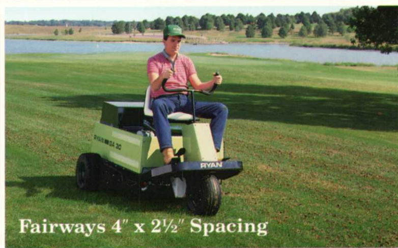
Fairways 4" x 2½" Spacing

Now you can deliver "greens-quality" aeration to your entire course with a single piece of equipment. Variable core spacing makes the GA 30™ aerator as good on fairways as it is on greens. Simply move the spacing adjustment control from 1"-5" or anywhere in between, lock it in place, and you're ready to go without leaving your seat.