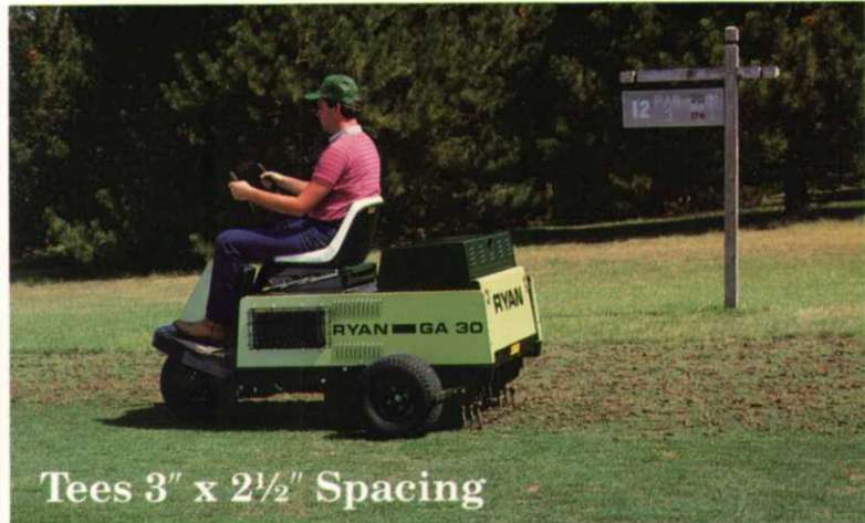
Tees 3" x 2½" Spacing