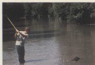
Would you believe they played this course five days later? ..... 50