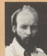
Cover Photographer DANIEL ZELAZEK

For reprints or other photographic needs, call Daniel at (407) 746-2123