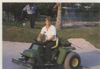
Distinguished Service Award is the highlight of his career ..... 34