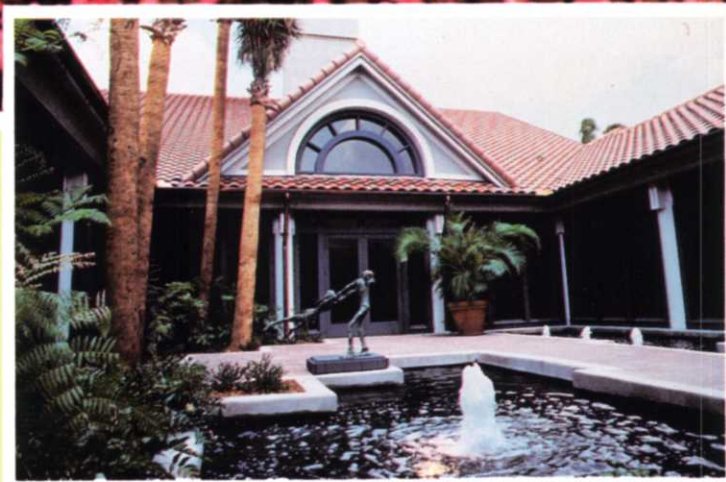
Conference Center where board meeting was held Saturday, August 6, 1988.