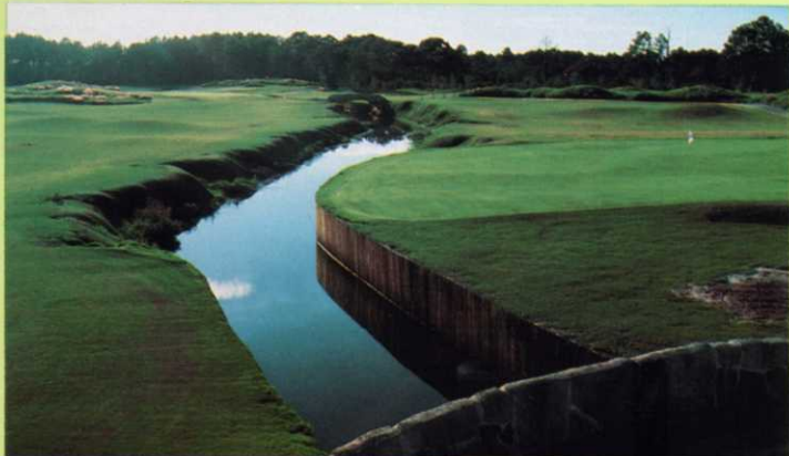
As for the golf course, Jack Nicklaus designed The New Course at Grand Cypress. The design was purposely planned to pay tribute to the great courses of Scotland. There are some similarities to The Old Course at St. Andrews like double greens, stone bridges, walls and burns.

Starting time for the shotgun tournament was 9:00 A.M. While the participants waited in their carts for the start, a hubbub of friendly chatter filled the morning air. Then, they were off anticipating a good round of golf.