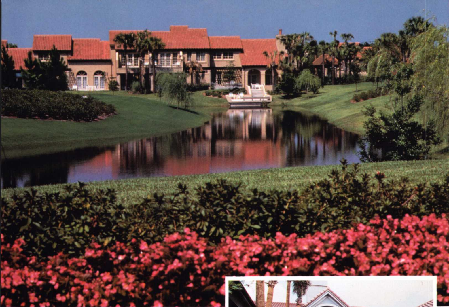
Villas of Grand Cypress — situated among the fairways and waterways of the Jack Nicklaus designed golf course.