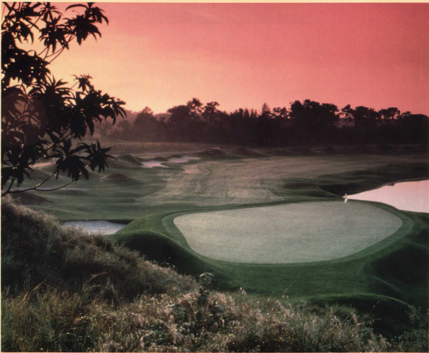
As the sun sets on the beautiful Grand Cypress Golf Course, we start anticipating the 1989 Crowfoot Open.

voted into the Golf Digest Top 100 Golf Courses in the United States.