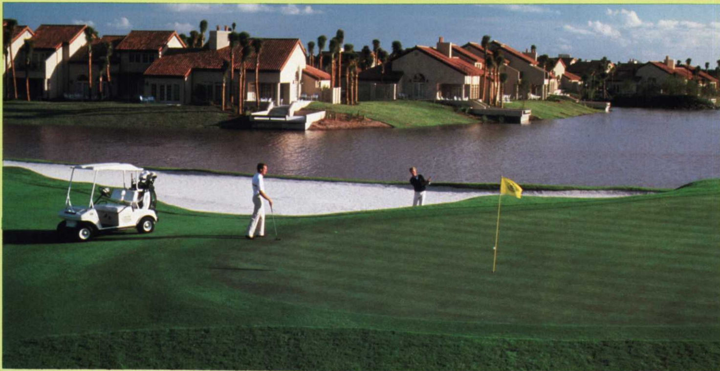
It was a very warm day and everyone appreciated the beverages waiting at designated areas on the golf course. At just the right time delicious boxed lunches were delivered to each person in the tournament.