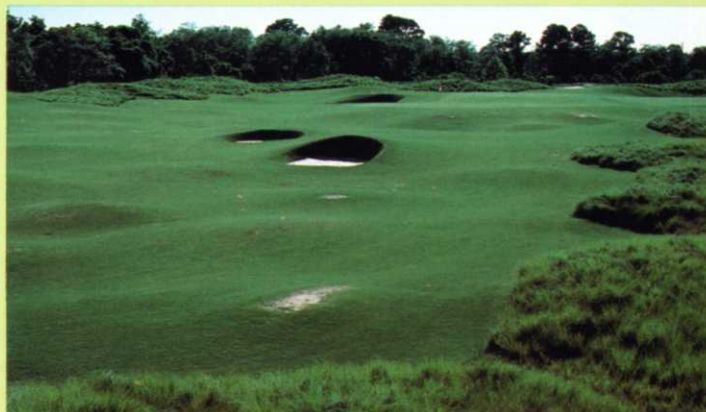
Golfers on The New Course have the feeling of playing in an open meadow. Very little water comes into play and few trees are located within the interior of the course.

tendent, gave a talk during the Buffet Dinner Sunday evening before the tournament. He knew this was the first time the Crowfoot Open was to be played on The New Course at Grand Cypress. His advice to everyone in the tournament was, "Stay out of the pot bunkers, watch out for the deep bunkers, and don't hit it in the Love Grass mounds. Those of you who have never played it before, GOOD LUCK!"