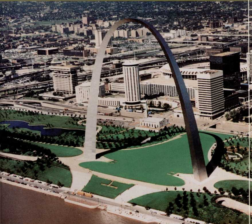
THE GATEWAY ARCH • ST. LOUIS, MISSOURI