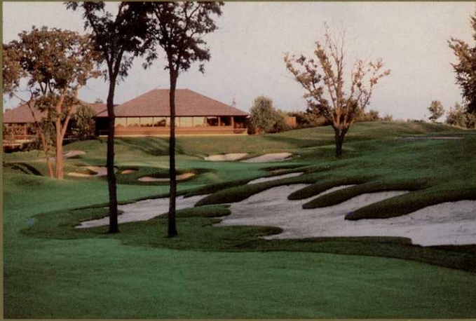
MUIRFIELD VILLAGE GOLF CLUB • DUBLIN, OHIO