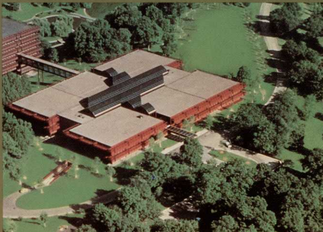
DEERE & COMPANY CORPORATE HEADQUARTERS • MOLINE, ILLINOIS