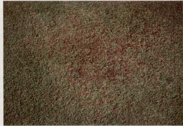
Figure 2 (Left) and Figure 3 (Right)