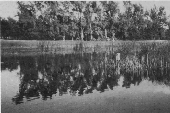
Natural harmony of wildlife, tropical vegetation, and man.