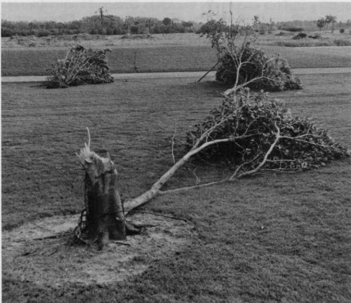
The camera can be a valuable tool for recording pertinent occurrences on the golf course.

Now that we have evaluated the best type of camera, operative settings, shutter speeds and the various types of film, let us look through the eye of the camera: the lens. The focal length of a lens is measured in millimeters, with 55mm being a true perspective to the human eye a wide angle 28mm would produce a panoramic view and items will look very far away. A telephoto lens, anything over 100mm, compacts the view and makes items seem closer than they really are. A zoom lens is the best of all worlds, although there are a few drawbacks. A 28mm to 90mm zoom lens encompasses most all focal lengths the average photographer will ever need, but the resolution quality is inferior to a standard lens. If you do not plan to make enlargements in excess of an 11 x 14, a zoom is best suited for you.