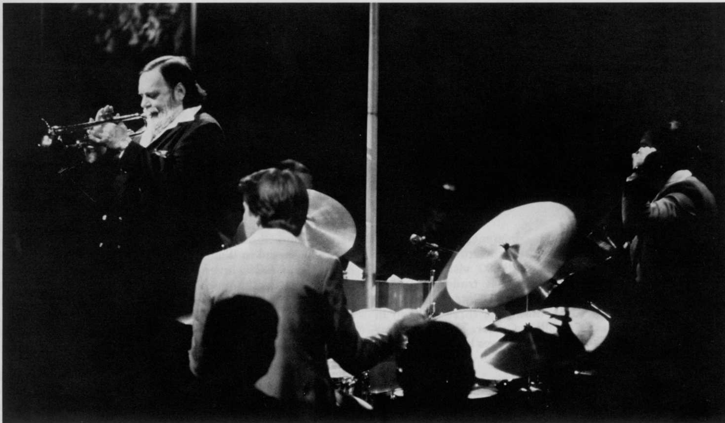
Super showman, Al Hirt, entertained guests of Rhone-Poulenc Inc. at his Bourbon Street night club. The Rhone-Poulenc "Chipco 26019 New Orleans Jam" event took place during the GCSAA's 53rd International Turfgrass Conference and Show, held in New Orleans recently.