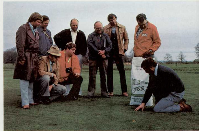
Members of LESCO sales team study at Turf Seed to learn why CBS LESCO Blend is the unbeatable blend.

LESCO Blend, a combination of Citation, Birdie and Omega (Syn B), gives users the benefits of a wide, diverse gene base for more consistent quality turf with a dark color, heat tolerance, and excellent mowing qualities vital for overseeding. This certified blend is your assurance of purity and quality.