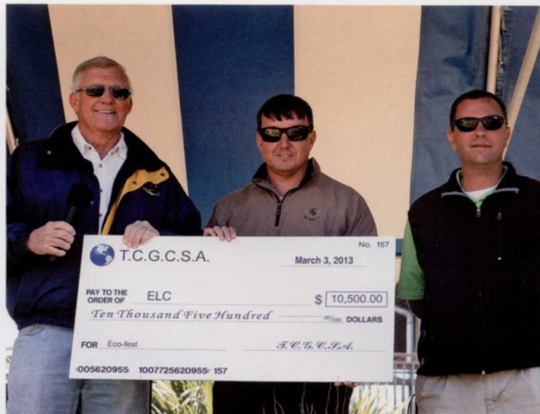
During the 2013 Blue Pearl Event at the Red Stick GC this past May, the Treasure Coast GCSA once again stepped up to demonstrate its local proactive environmental stewardship efforts by donating $10,500 to the Environmental Learning Center in Vero Beach.