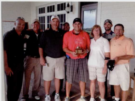
The Calusa GCSA team was victorious in the 2013 edition of the Calusa-Suncoast joint meeting golf match. Joint chapter meetings are one way for chapters to enhance superintendent participation.