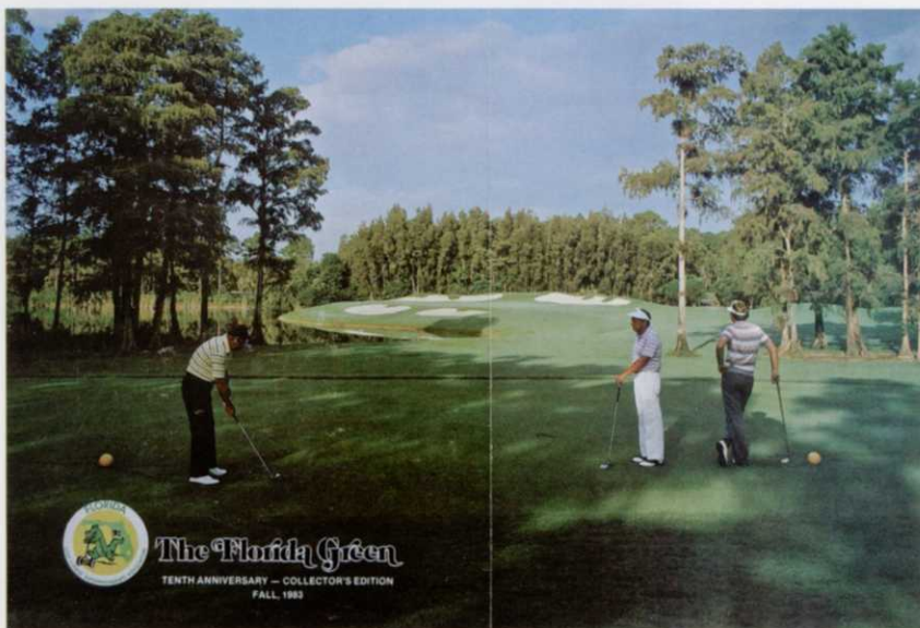
First Foldout Cover 1983. 16th Hole, Banyan CC.