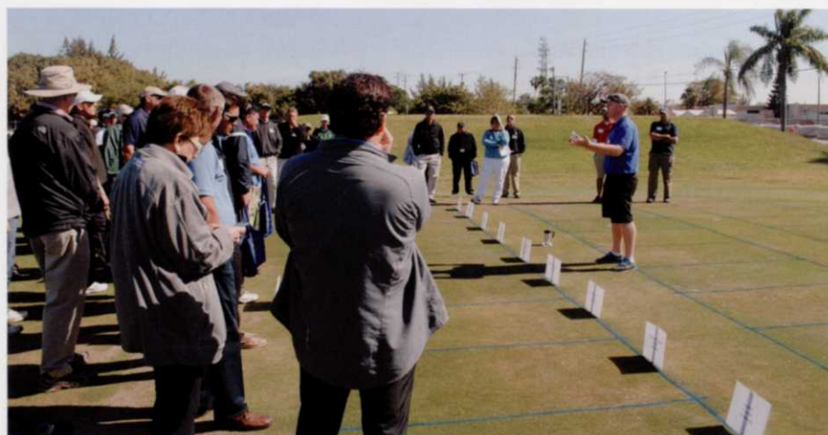
The Annual South Florida Turf Expo at the UF/IFAS station in Ft. Lauderdale drew a near-record crowd of over 400 people from all aspects of the turf industry. Featured sessions included research plot tours and updates, supplier products expo and demos, technician training sessions and classroom seminars.