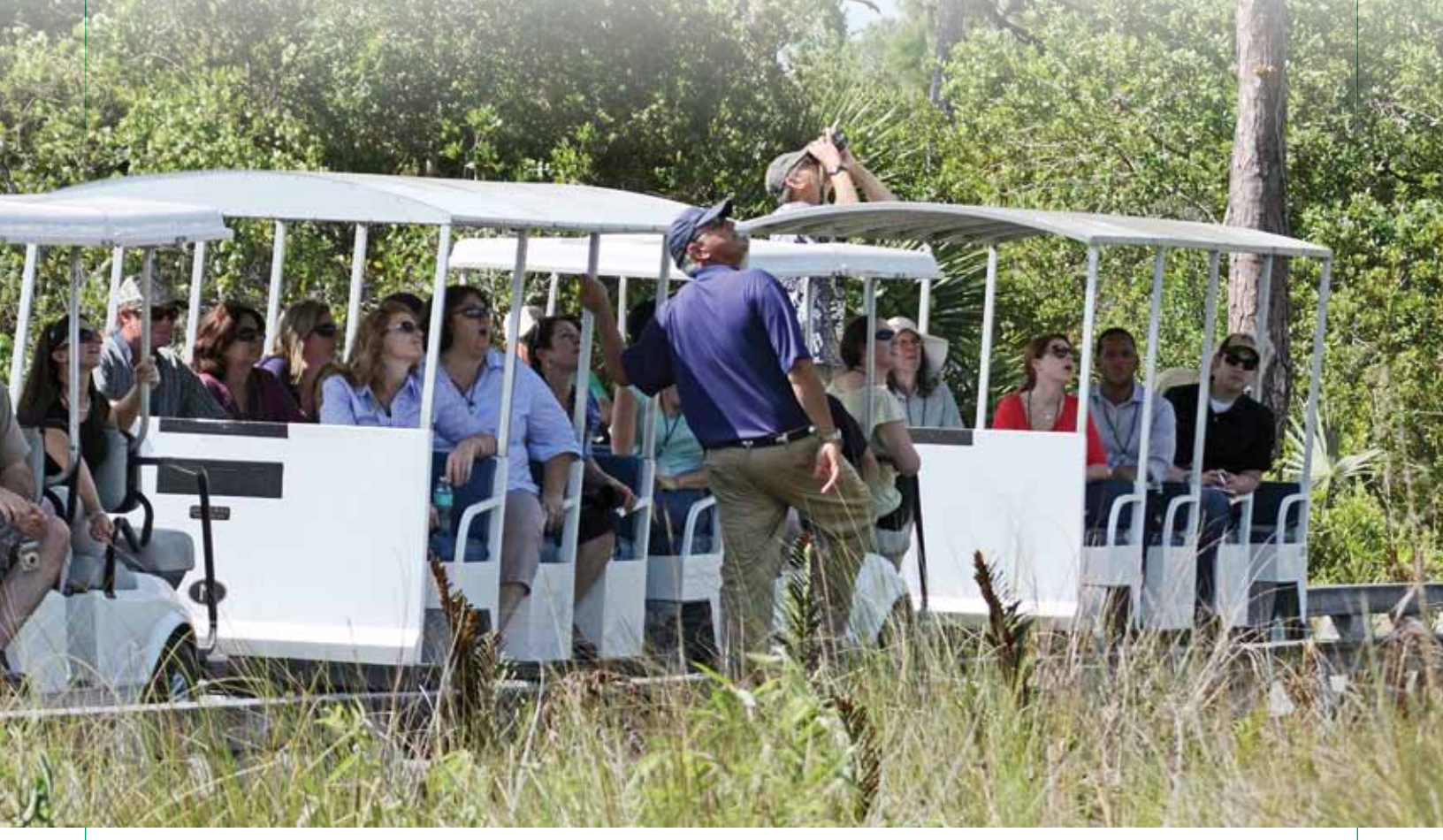
The tour group stops to watch a family of bald eagles soaring over the Old Collier course.

Over the years I have watched the reaction of these regulators on the tour of Old Collier. When the facts of actual acreage under maintenance and the amounts of pesticides applied, the light begins to come on. And there is nothing better than the wildlife sightings as we ride the course. Given that mid-afternoon is not the best time for sightings, we still manage to find gopher tortoises, gators,