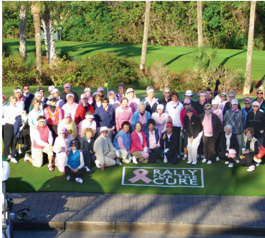
Give fundraising tournaments some extra flair with turf painting.