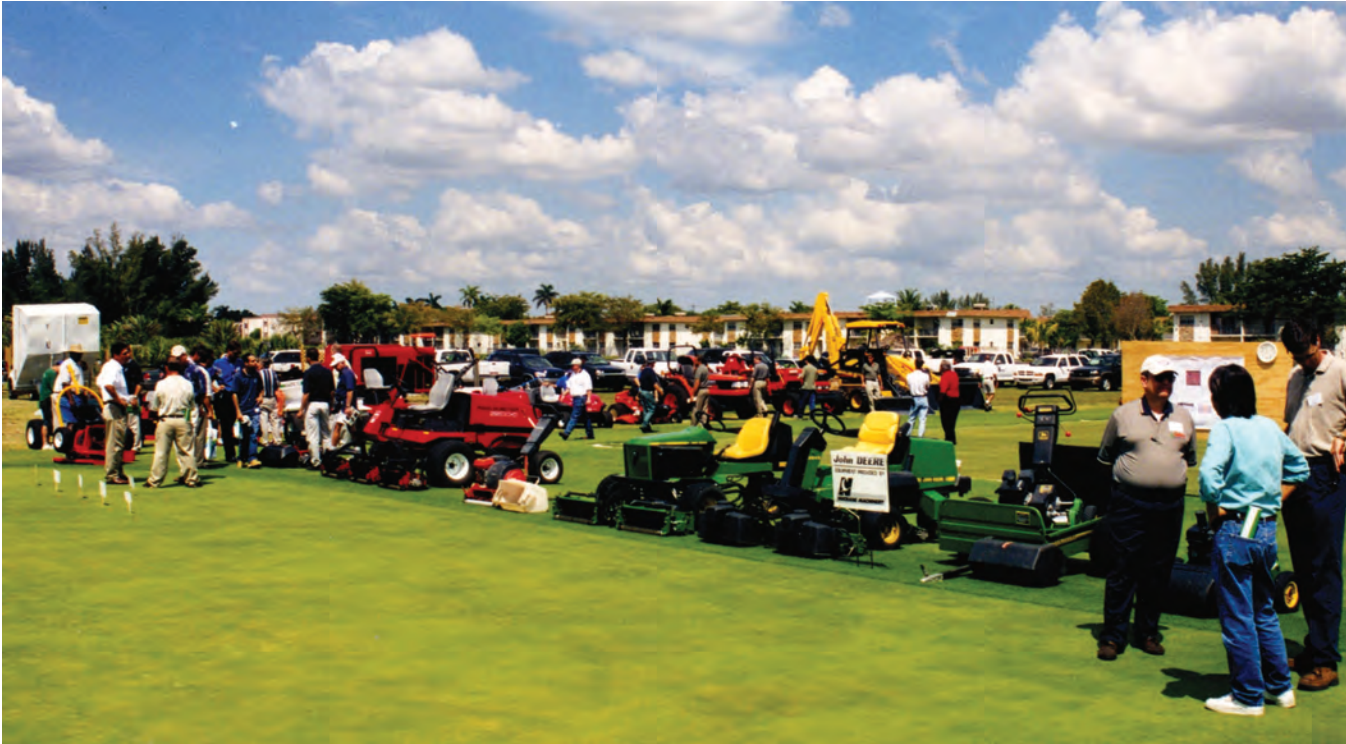
Equipment on display at South Florida Expo Demo Day.