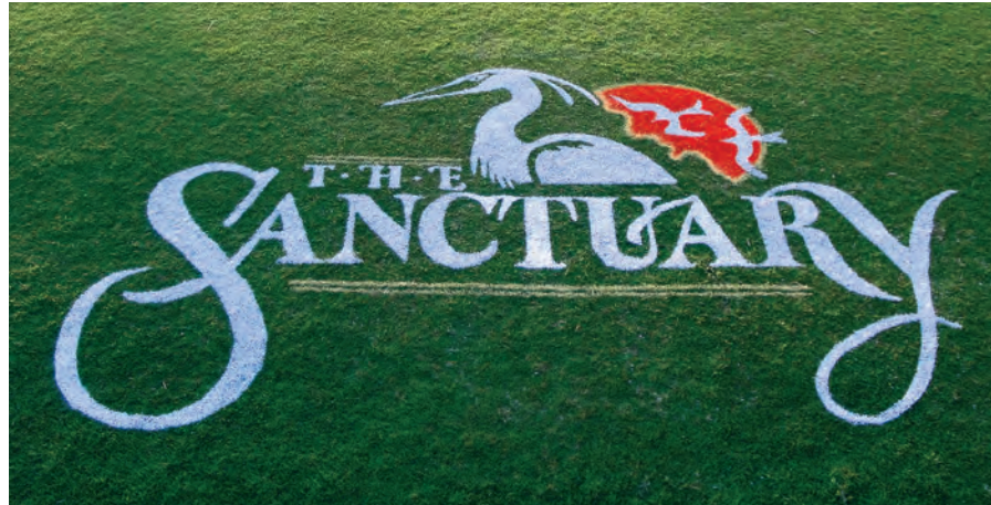
A putting green slope is an excellent location for a turf painting.

First, you will need the desired design electronically produced on your computer. Use an LED projector to project that image onto a material on which you can easily create a stencil. 1/8-inch white hardboard works well