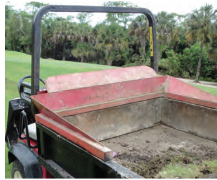
Custom-made rack prevents loads from shifting forward causing injury or damage.

When finished, the six posts welded to the underside of the frame are inserted into the two front and two side pockets of the Toro cargo bed. After insertion, Roepsch recommends tack