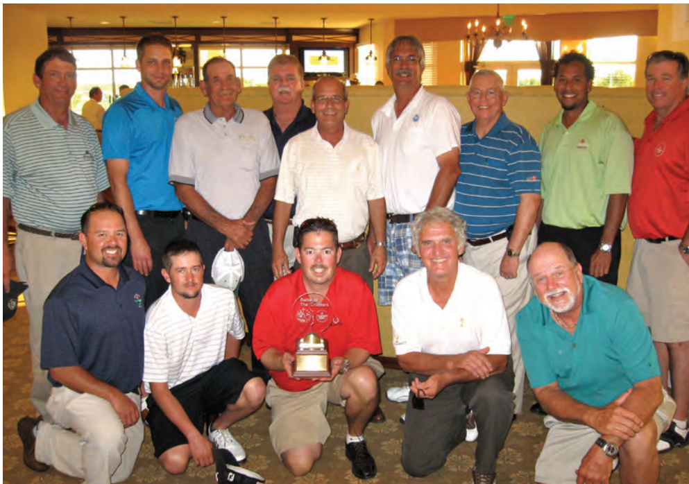
Camaraderie was the order of the day at the joint meeting of the Calusa and Suncoast chapters at The Plantation CC in Ft. Myers. This year the Suncoast won the Ryder Dup golf match.

was on hand to receive a $2,000 check to be distributed to worthy turf students.