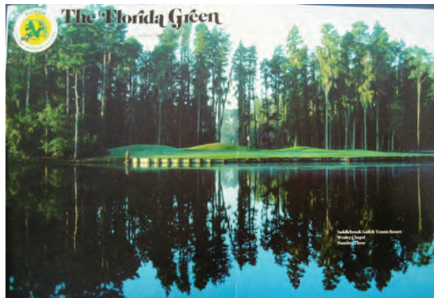
Winter 1995. The era of the gatefold covers. Saddlebrook GC.