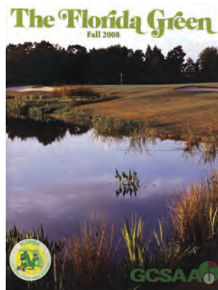
Fall 2008. Resource stewardship forced a return to the vertical covers in 2008. The GCSAA logo was added in 2007.

Thirty years later the Florida Green goes to every golf course superintendent and club in the state with a known address. It is the official voice of the FGCSA and seeks to educate and promote the professionalism of our members.