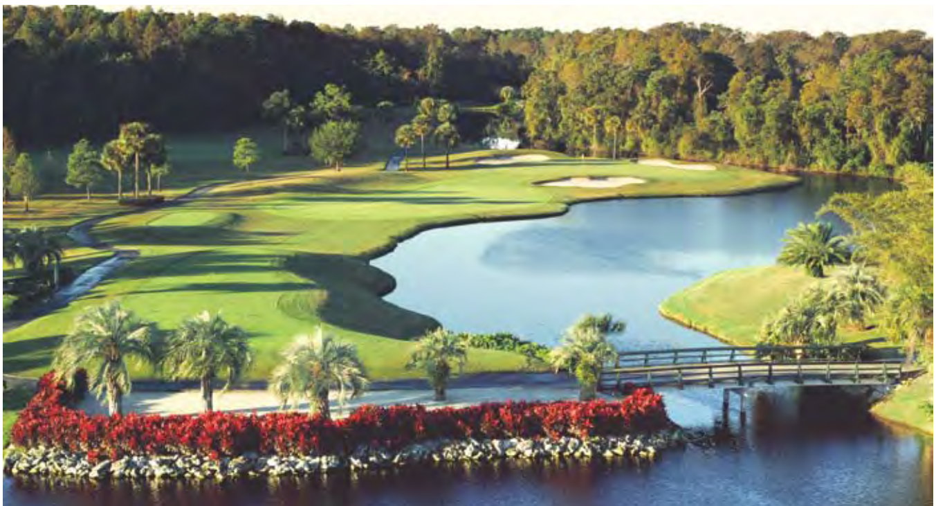
Third hole, Disney's Palm Course, one of the courses involved in PGA tournament play since 1971.