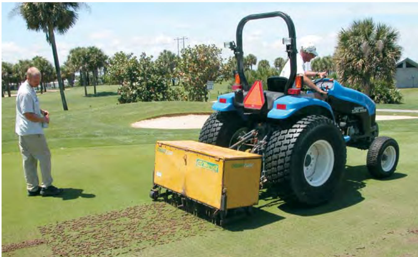
Aerify using smaller diameter tines in the fall to speed up turf recovery.