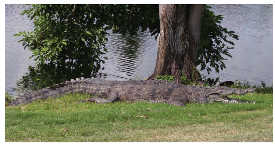
A crocodile makes a rare inland appearance and a interesting entry on the Palmetto G.C. wildlife inventory.