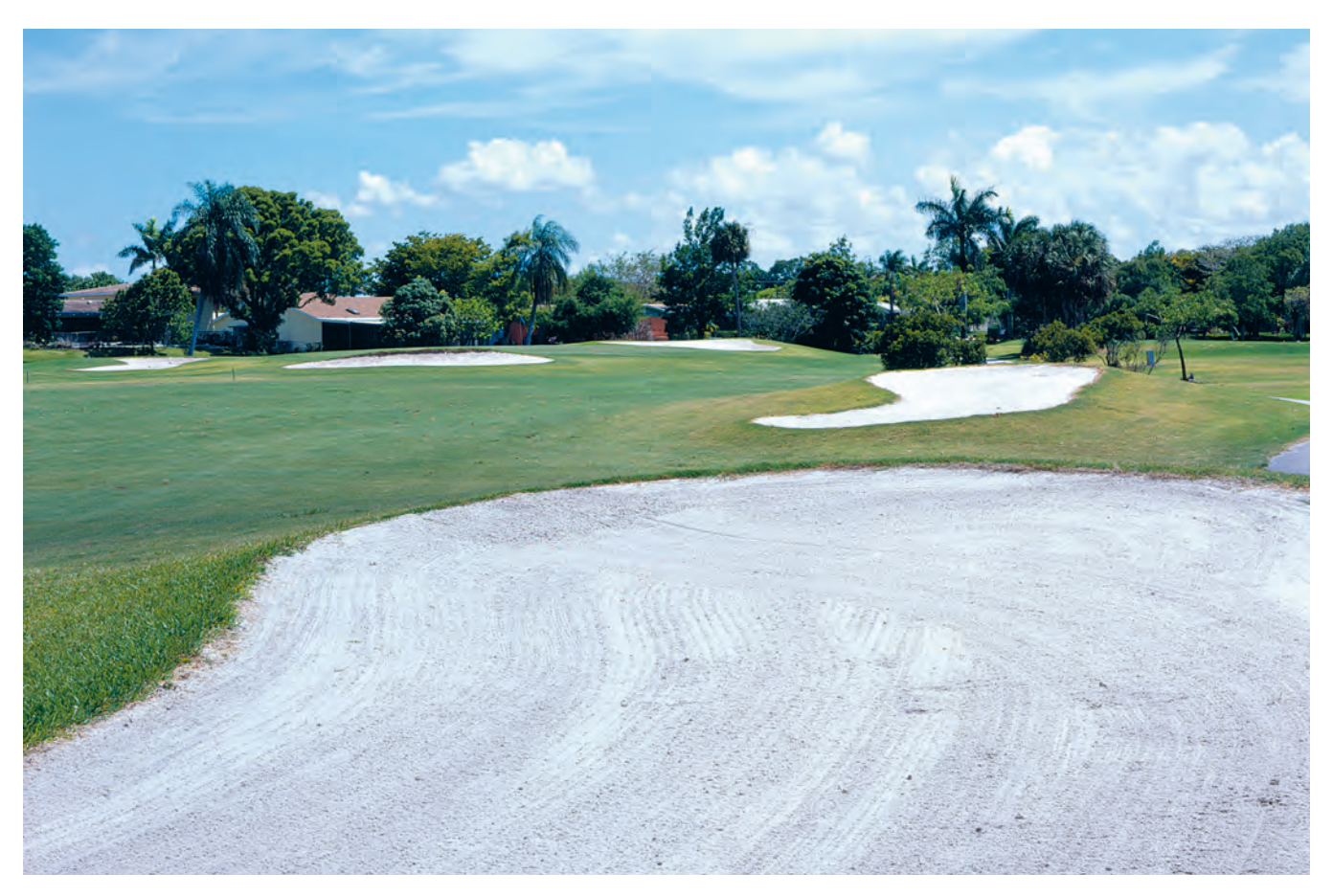
A view up the 1st hole and a few of the 81 sand bunkers on the course.

interested in golf and had been to Palmetto several times and there was this opening for a cart man. It was a perfect match. Earn money, go to school and play golf for free.