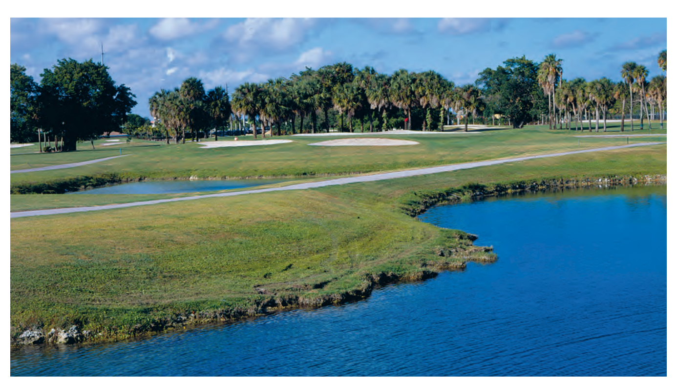
You have to contend with a small lake and the cross-course canal on the par-3, 7th hole.