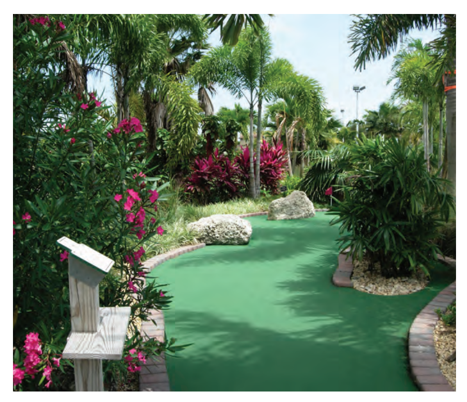
Palmetto GC's beautiful and fun miniature putting course.