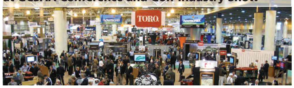
Opening day of the Golf Industry Show in New Orleans looked almost normal, but when the week was over, total numbers were predictably lower than the past few years as the recession took its toll on attendance and participation.