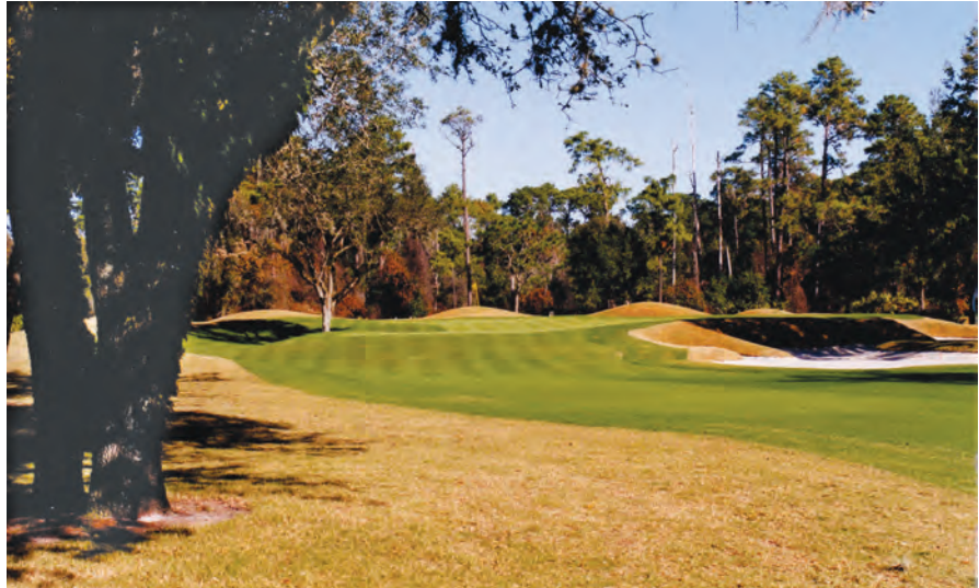
Pleasing stripes and protecting dormant turf are two reasons for overseeding, but new grasses and milder winters are changing programs.

While overseeding in the winter provides aesthetically pleasing stripe patterns, recent drought periods and subsequent watering restrictions of up to 45 percent cuts in allotments have superintendents and clubs taking a harder look at their programs. Appearance isn't the only reason a course overseeds. Heavy winter play can wear out the