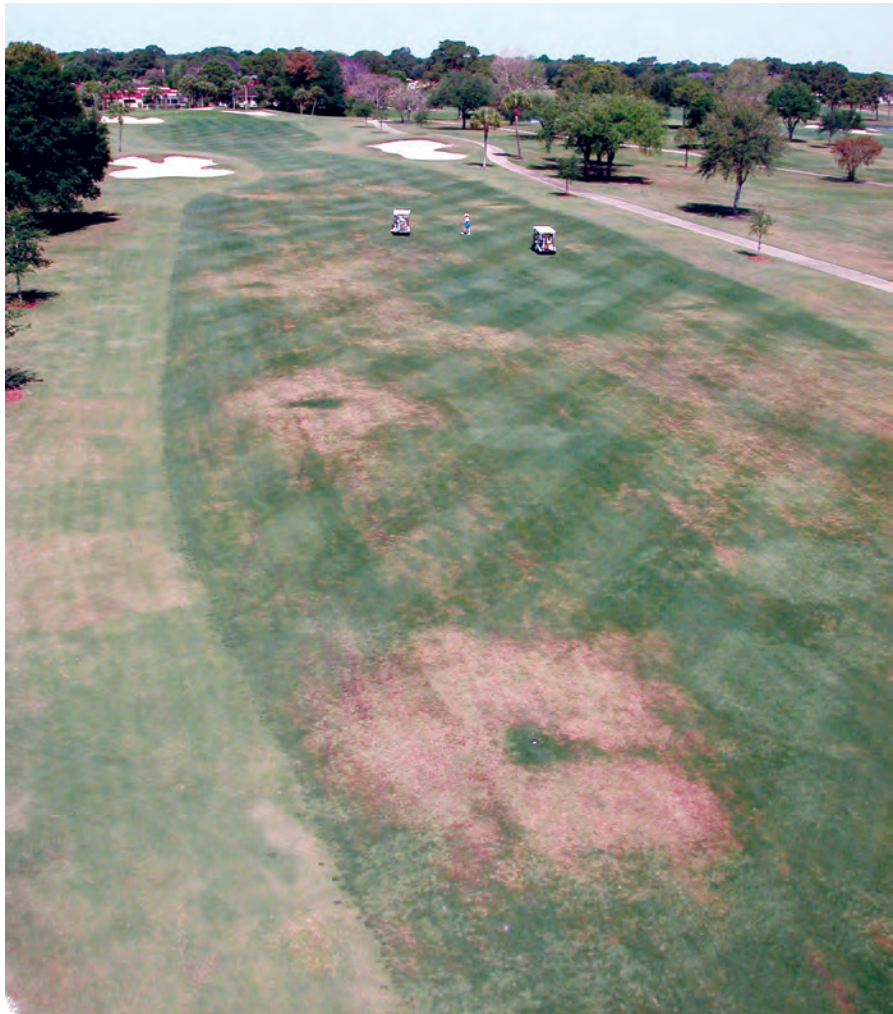
Panic often develops when the dreaded brown spot occurs.

National drought surveys indicate that nearly half of the U.S. is currently experiencing drought, and water restrictions have been mandated at golf courses across the United States. The fairways may get a little firm and lose some color, but with traffic control and prudent cultural programs, much of the turf can survive without water for extended periods. Every lie might not be perfect, but isn't this part of what makes golf such a great game? When the course gets dry during the summer months, then use those conditions for more roll and to play different types