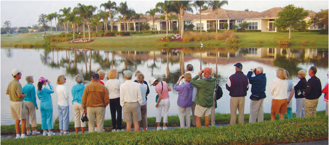
Members and guests enjoy the annual golf course “Bird Walk” hosted by the Grand Harbor Audubon Society in the winter of 2006.