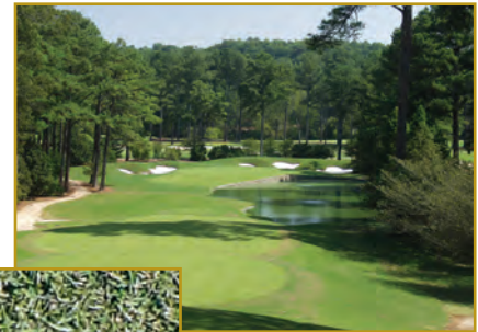
Atlanta Athletic Club Tees & Fairways