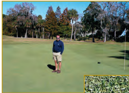
Shipyard Golf Club

Diamond Zoysia is a fine textured, vegetatively propagated, warm season variety with excellent tolerance to low light conditions, salty soils and high traffic. Diamond is best maintained at a very low mowing height and has outstanding recuperative abilities making it a logical choice for golf course tees, collars, as well as putting surfaces. Diamond has better fall color retention than most other zoysiagrass varieties and has an early spring green-up.