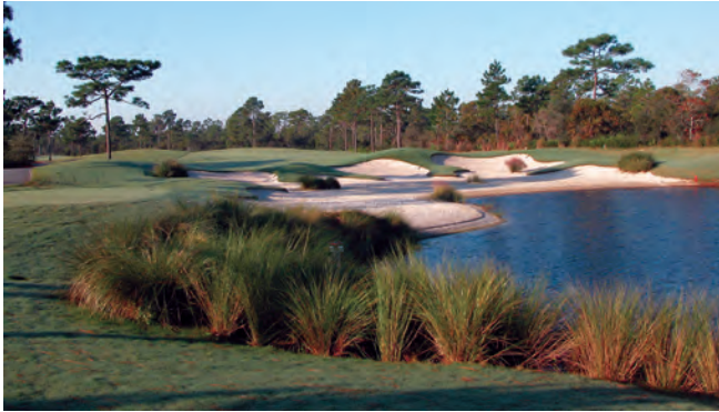
Dawn breaks on the 1st hole at the St. James Bay G.C.

the course as an ACSP Silver Sanctuary all in the same year.