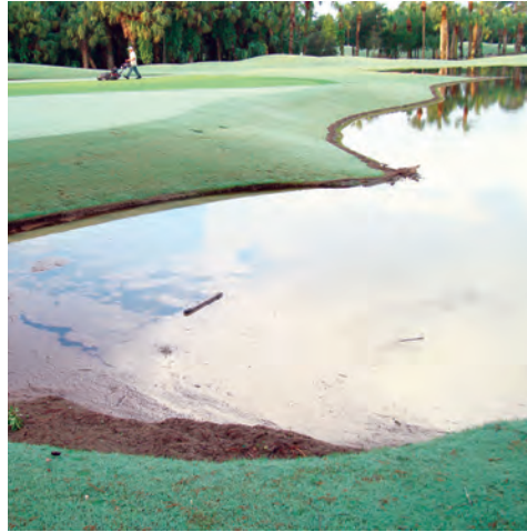
Is this a water hazard or a bunker at the Olde Florida GC? Thanks to Tropical Storm Fay it's hard to tell.