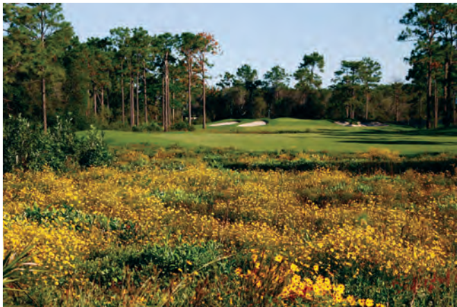
The wildflowers are in full bloom in the natural areas on the 16th hole.