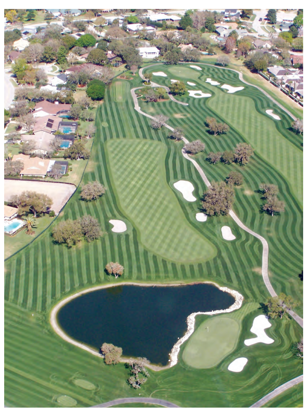
Aerial View of the 12th and 13th holes at Bay Hill during the Arnold Palmer Invitational.