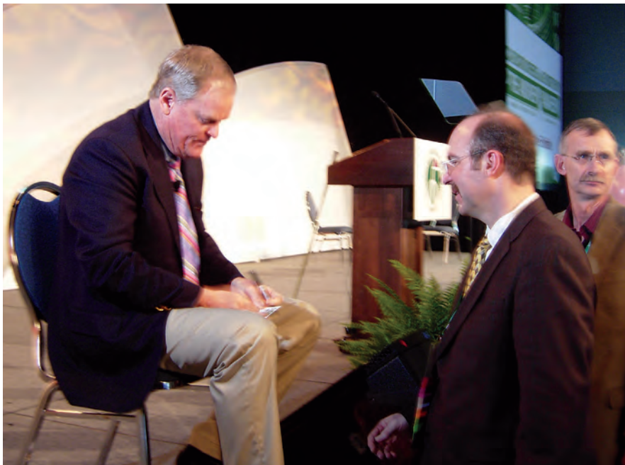
One of the largest post session crowds ever stayed around to meet and greet Johnny Miller after his emotional Opening Session speech.

Next Johnny Miller, the often critical King of Grain golf announcer, proved to be quite human as his love of the land and of his role as family man came through a surprising and emotional keynote address during the memorable and diverse Opening Session. The session began with a couple of Native American songs played by members