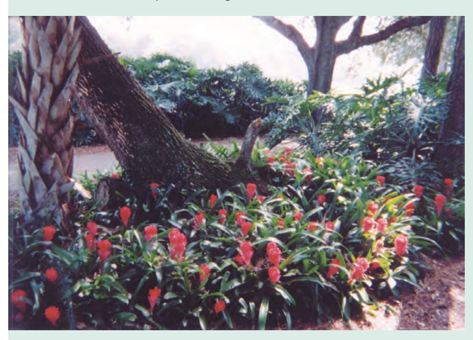
Second Place – Bright red bromeliad bed under the oaks at No. 18 tee.