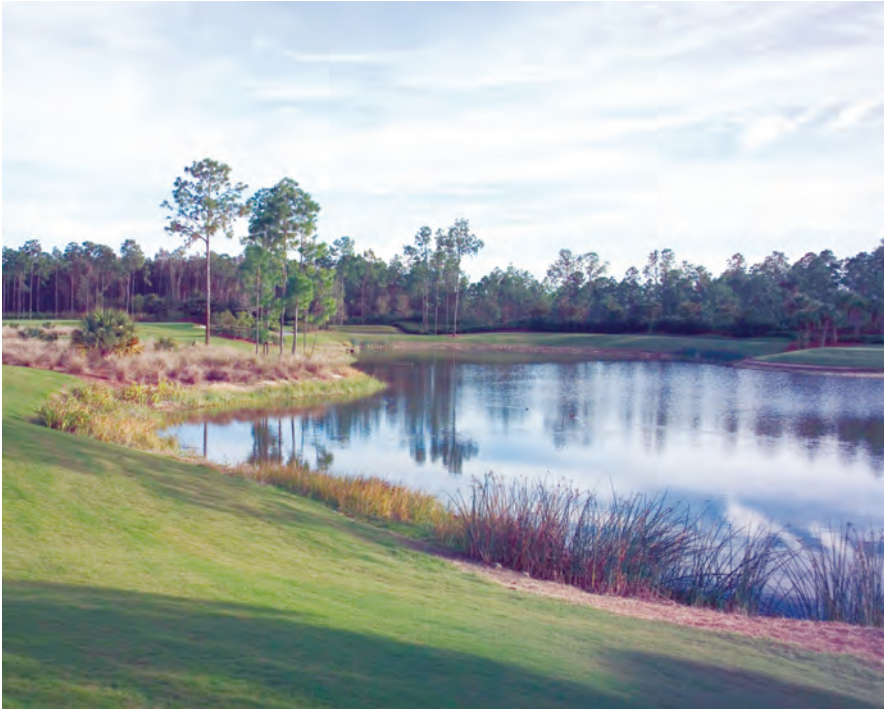
Lake shorelines buffered with native plants protect the water quality of the golf course lakes.

received the Award of Excellence for Open Spaces from the Florida Chapter of the American Society of Landscape Architects. The community is being created with the intimacy, charm and classical style of the Mediterranean region of Europe. The overall master plan for the 1,697-acre community may include up to 950 residences and more than 1,000 acres of open space. Residents are eligible for membership in The Club at Mediterra, which offers a 25,000-square-foot clubhouse, named best clubhouse in 2004 by the CBIA, and a tennis, swim and fitness center in addition to the two Fazio golf courses,