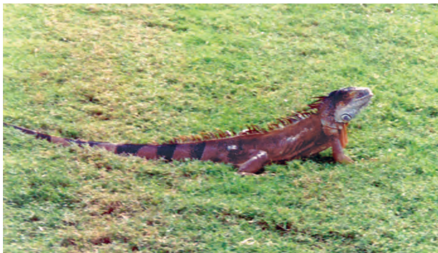
An iguana is a rare addition to the wildlife inventory. This one visits the Hobe Sound Club regularly.

pelicans return seasonally. They compliment the many other species that make Orchid Island their home. These include snowy egrets, spoonbills, wood storks, cormorants, ibis, several different species of ducks, and many other of our feathered friends. We even occasionally have a bald eagle visit us! “