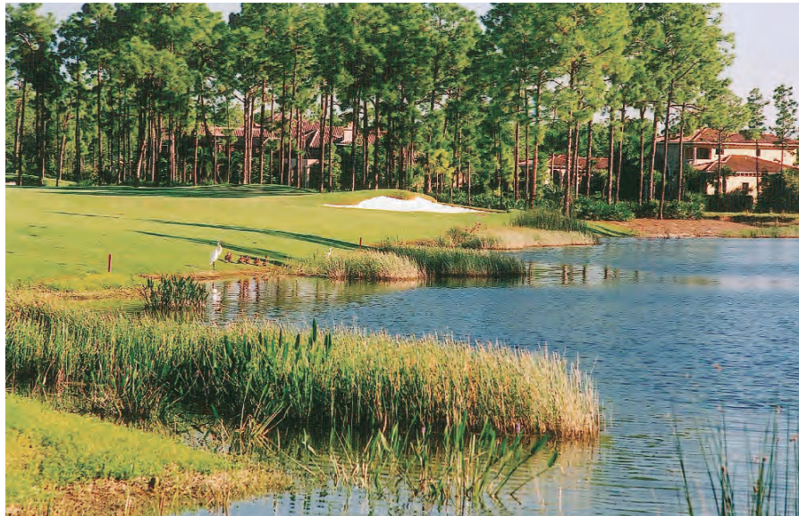
Win – win – win! Homes, golf course and wildlife co-existing lakeside at Mediterra.

Recertification signifies that a site and its management are committed to environmental quality and sustainability, the main components of the Audubon program. To achieve recertification, work begun the previous year continued in six key areas: site assessment, wildlife habitat enhancement and management; waste management; energy efficiency; water quality and conservation; and inte-