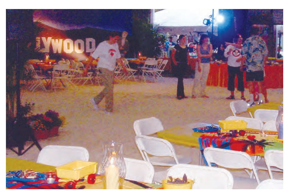
The members and interior decorators took over to finish the transformation to a beach scene.

the interior and exterior with palm trees, murals, ceiling coverings, food and beverage tents, bars, and seating for more than 200. Once the band set up, the preparation was complete, and the facility didn't look or feel much like the "shop" we started with earlier in the day.