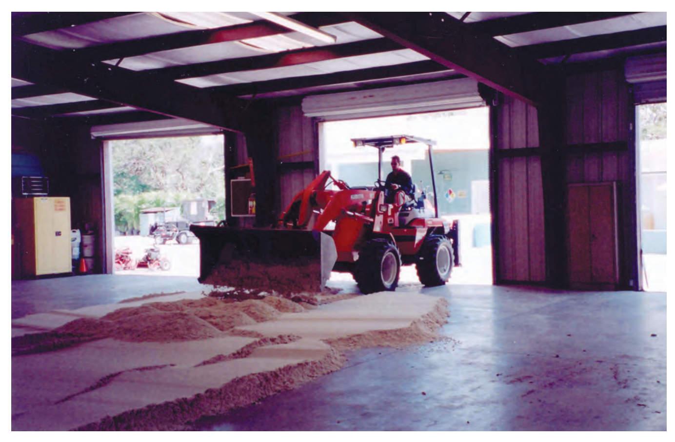
How to build a beach. Start with 20 tons of sand and an empty maintenance b uilding.

dred feet from the best beaches on the Gulf Coast, we needed the beach at our front door. With 20 tons of fresh bunker sand delivered, we got it. All of the equipment was removed from the shop. If it wasn't bolted down, it was removed. And we placed the sand throughout the entire equipment-storage area with a front-end loader. A dance floor was created with sand approximately 6 inches deep and, throughout many seating areas, the sand was installed at a 3-inch depth. A bunker rake was used to thoroughly smooth the surface and the result was amazing.