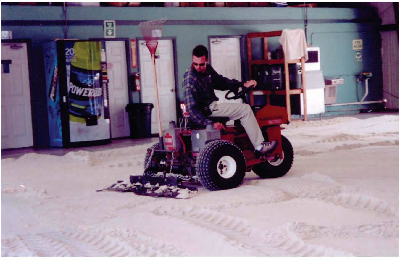
Bunker rake. Beach rake. What's in a name? It smoothed out our indoor party beach just fine.