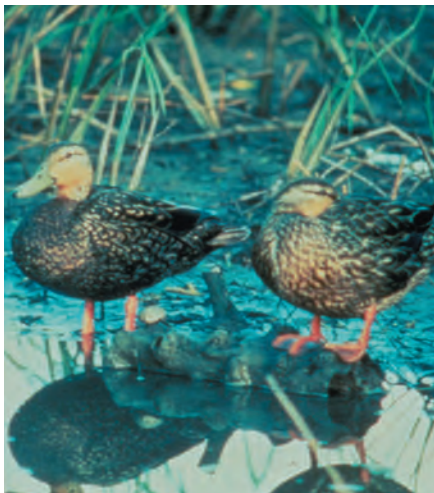
Male and female mottled ducks both look similar to female mallards, but have lighter colored heads and bills.

transmit diseases and compete with all wild ducks for food and habitat. Additionally, domestic mallards pose a specific risk to the Florida mottled duck — the threat of extinction through hybridization. Unlike wild mallards, which migrate north in the spring to breed, captive-reared mallards have become established as year-round residents that are