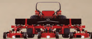
PRO-FLEX 120 10 FOOT ROTARY CONTOUR MOWER

When you need to speed up the transition to Bermuda grass from being overseeded this coming spring, the only mower to do the job is the Progressive Pro-Flex 120 . Used by a number of golf superintendents on the Atlantic coast, the Progressive Pro-Flex 120 is a proven performer that will cut your roughs down quickly year round as well as effectively assist in a speedy emergence of your Bermuda roughs. For more information call Jon Mahannah (772) 260-2510.