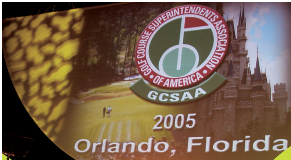
Huge logo projected over the dais at the Opening Session.

The main thing about the show is that I didn't see or feel any loss of superintendent identity or ownership of the event that some people either feared or predicted. As for our industry partners who help support us at the national level all the way down to the local chapters, I know this combined show concept has to be very welcome from a financial as well as practical standpoint. The future of trade shows was hanging in the balance and this reorganization is a good thing for all concerned. So, on with the show!