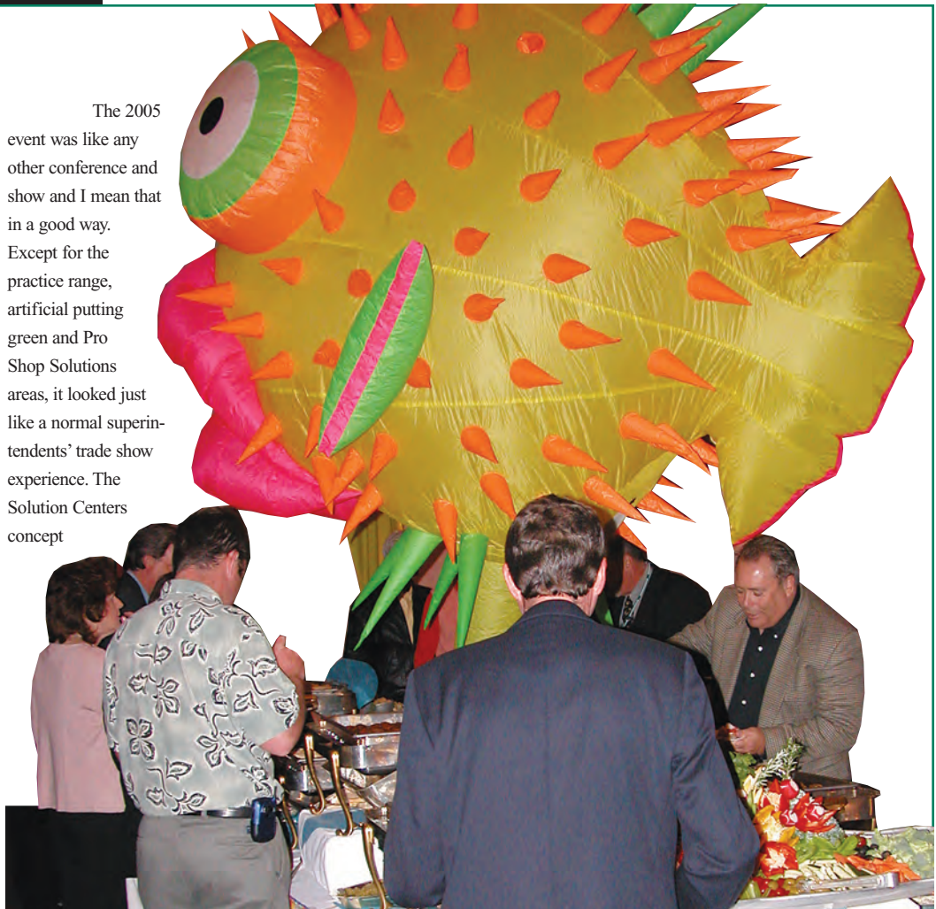
Colorful decorations created a festive tropical island backdrop for the 2005 FGCSA Reception.

The 2005 event was like any other conference and show and I mean that in a good way. Except for the practice range, artificial putting green and Pro Shop Solutions areas, it looked just like a normal superintendents' trade show experience. The Solution Centers concept