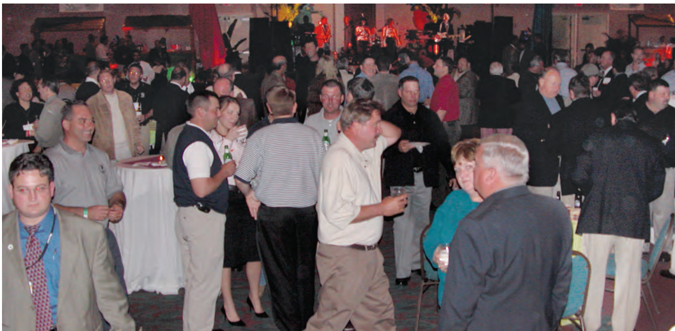
At last count over 900 people attended the FGCSA Reception at the 2005 GIS in Orlando.

One other high number that was typical when the GCSAA comes to Orlando was the over 900 people who attended the FGCSA Reception on Thursday night at the