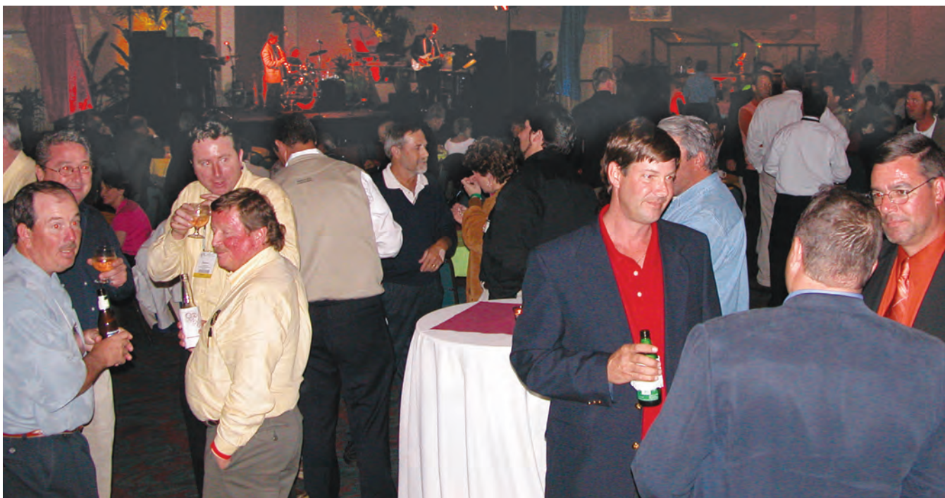
Networking and socializing are valuable benefits of attending the Golf Industry Show.