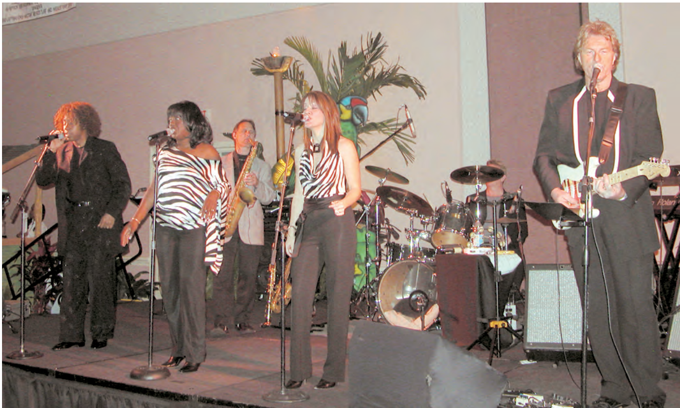
Powerhouse was the name of the band at the FGCSA Reception and they put on a great show.

poignant and humorous golf anecdotes as only he can.