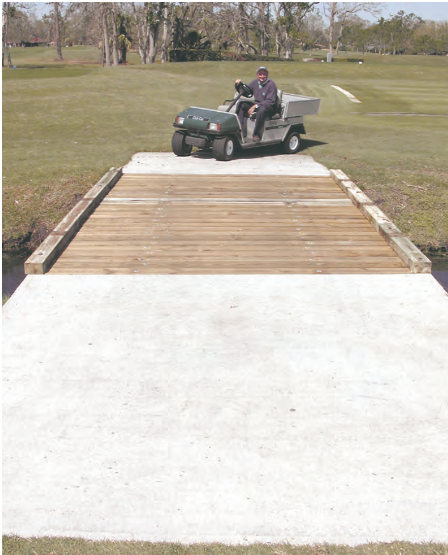
One of eight new bridges installed by the Winter Pines staff.