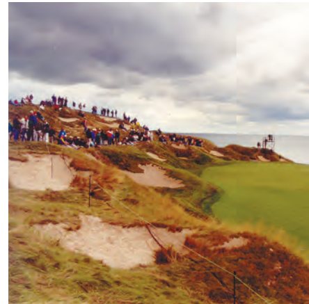
The open, rugged and windswept terrain at Whistling Straits translates into often deep, steep-faced challenging bunkers to maintain.

Of the four courses at Kohler, 36 holes are located at Blackwolf Run. Blackwolf Run, designed by legendary architect Pete Dye, opened for play in June 1988. The remaining 36 holes are located at Whistling Straits. Whistling Straits opened in 1998, and was also designed by Pete Dye.