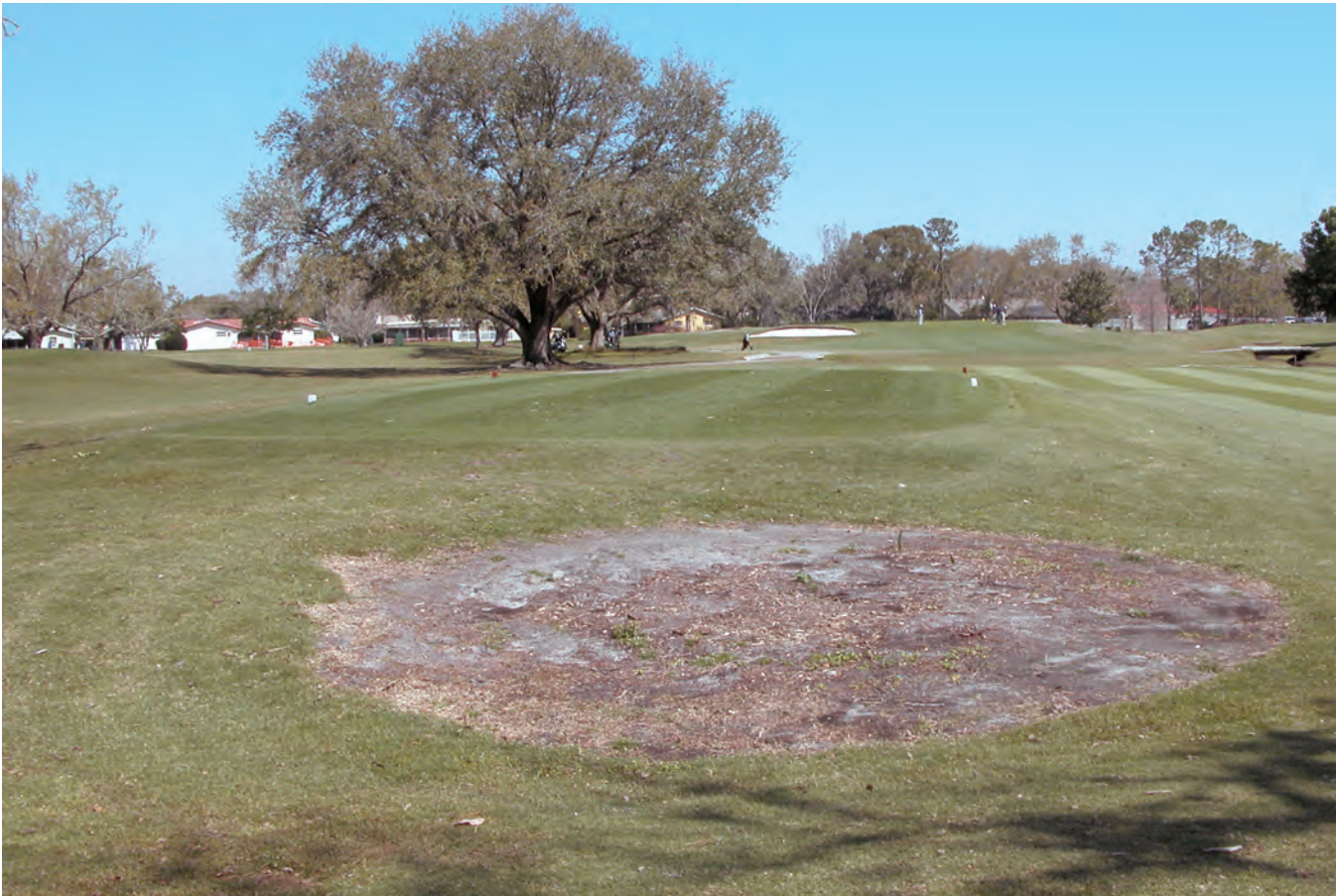
Removal of stumps and sodding the gaps left by storm-damaged oak trees became the Winter Pines G.C. unplanned, in-house project for 2004

Another key consideration is the expertise of the staff to handle overly ambitious projects. Not everyone was born a civil engineer or golf course architect and that goes for the