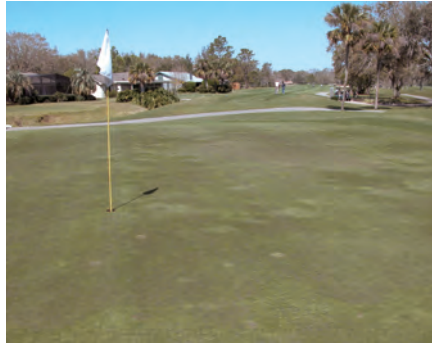
Winter Pines has been selectively rebuilding the old push-up greens over the years to improve drainage and performance and to replace contaminated putting surfaces.