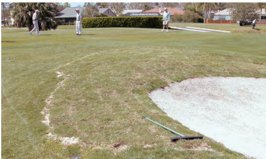
The project to lower a high bunker lip was a snap compared to some of the long-range, in-house projects accomplished at Winter Pines.

greens also suffered from some of the typical off-type contamination/mutation prevalent in that era and some gave us problems at different times of the year.