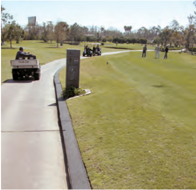
Railroad-tie curbing is installed along the new paths at the tee boxes. Non-skid rubber mat runners are installed to prevent golfer slips and falls.