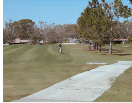
New 7-foot wide concrete paths replace and re-route the old asphalt paths. The crew often led by the owner Ed McMillin pours the new path in 110-foot long sections, which equals one truck load of concrete.

When I first started at Winter Pines in April 1979, the owners had just built five new holes. They installed new irrigation on those holes and on parts of the other four holes on the front nine. The rest of the course had some automatic controls on greens and tees and all quick couplers in the fairways.