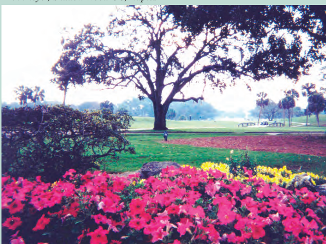
Second Place - "View to #10 Tee" by Tom Biggy, Bent Tree CC, Sarasota