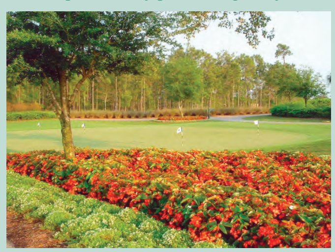
First Place - "North Course Putting Green with Annuals" by Trevor Brinkmeyer, Shadow Wood CC, Naples