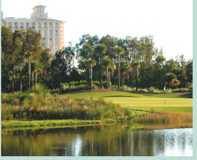
Accommodations for the event were provided by Hyatt Regency Hotel seen here overlooking Raptor Bay's 6th hole.

Even if your golf game lets you down on tournament day, the prize-packed raffle offers plenty of