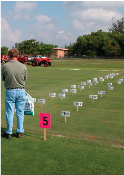
Ultradwarf test plots at the IFAS Research Center in Ft. Lauderdale

Turfgrass variety is only one of the many factors that influence the performance of a putting green. While the ultradwarfs can be a major