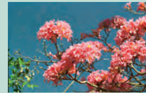
Purple Trumpet Tree

Characteristics: A variable species in size and shape