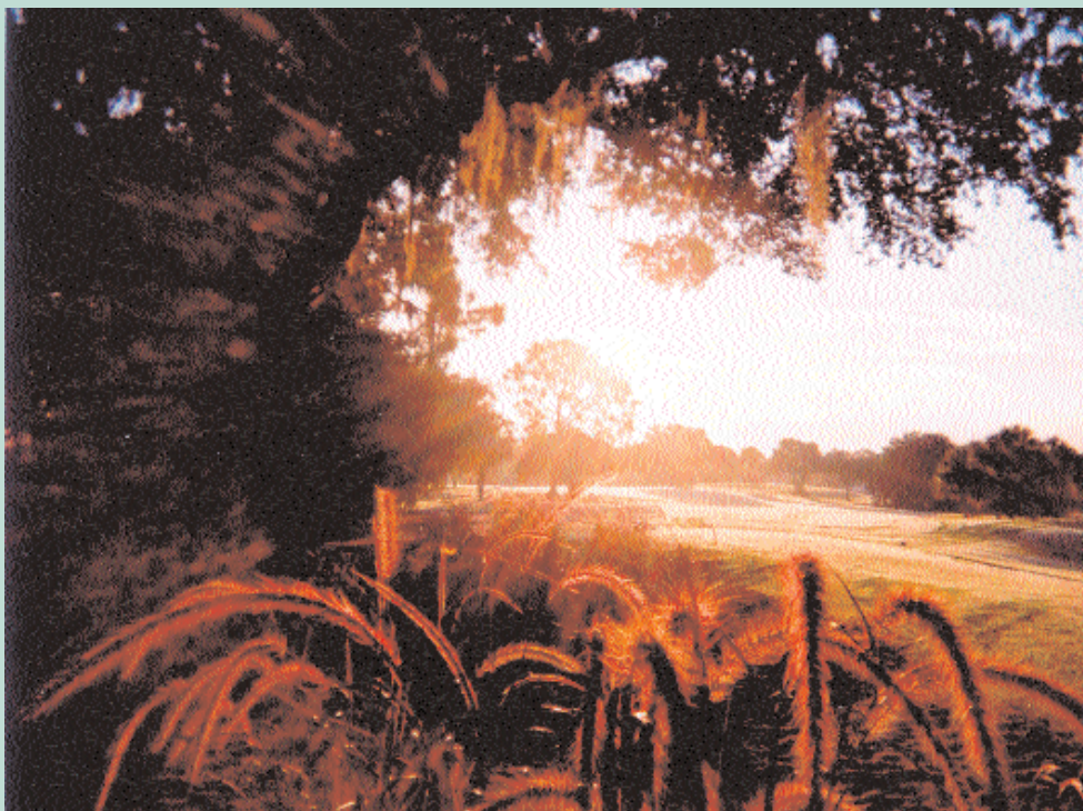
Second Place - "Fountain Grass along No. 4 Tee" by Tom Biggy, Bent Tree CC, Sarasota