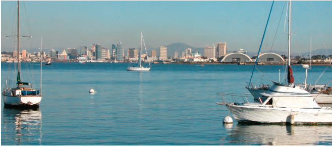
This was my view every day on the shuttle bus from my hotel on Shelter Island to the convention center. We saw every type of vessel in the bay: yachts, sailboats, tuna boats, freighters, cruise ships and aircraft carriers.