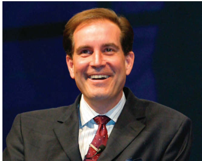
CBS Sports announcer Jim Nantz, the voice of the Masters, pledged to do a better job of telling the story of golf maintenance during tournament broadcasts during his presentation at the Opening Session in San Diego.