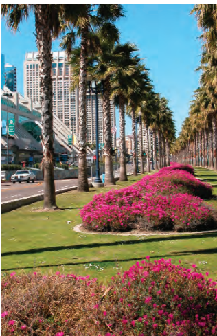
The newly expanded convention center is to the left. The towering palms and bougainvillea bushes welcomed us to downtown San Diego across the street.