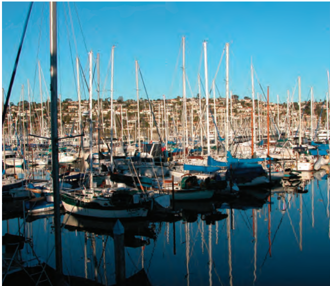
This was the view from my room at the Bay Club Hotel and Marina

84th among the top 200 tradeshows (there are more than 4,500 trade shows in the U.S. annually).