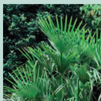
Needle Palm.

For a plant to be considered a Plant of the Year, set criteria must be met. Selected plants have good pest resistance, require reasonable care and are fairly easy to propagate and grow. The award winning plants must also exhibit some superior quality, improved performance or unique characteristic that sets it apart from others in its class. Here are two 2004 selections for your consideration: