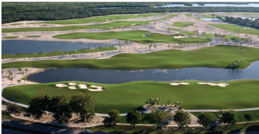
WCI's new Hammock Bay Golf Course on Marco Island is grassed in SeaDwarf seashore paspalum from tee to green.

“No additional breeding work was conducted on Adalayd after its initial introduction into the United States. Additionally, no management packages were developed for this grass and it was essentially handled like hybrid bermudagrass. The use of too much fertilizer and untimely irrigation