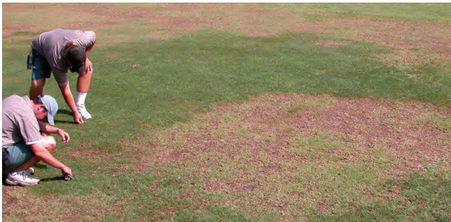
Nematodes killing ryegrass overseeding and weakening the base bermudagrass.

the winter play season. The weather can make it difficult to stay on schedule with course maintenance programs, but if basic and necessary practices are deferred or cancelled, problems will be experienced later in providing the level of conditioning desired through the winter golf season.