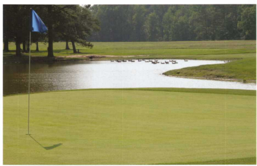
Joining the ACSP program provides a simple plan for documenting and getting recognition for the environmentally friendly things courses are already doing.

One goal identified so far is to document the business value of ACSP affiliation. Does it save you money, and how? Another goal is to explore the possibility of creating business incentives. For instance, is it possible to receive supplier