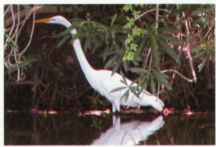
A UF/IFAS study documents that golf course water bodies are great habitats for waterfowl and wading birds. Great White Heron on the Copperhead GC at the Innisbrook Resort.