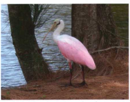
Florida led the nation in the number of courses participating in the 2003 Birdwatching Open sponsored by Audubon International. Roseate Spoonbill at The Moorings Club in Vero Beach.

Many birds migrate along fairly predictable routes known as flyways. These follow major rivers, coastlines, and mountain ridges. In addition to highlighting this year's highest ranking golf courses, we've divided our "2003 Best of" list along migratory flyways to account for regional variation, particularly in the Southern Zone (Florida