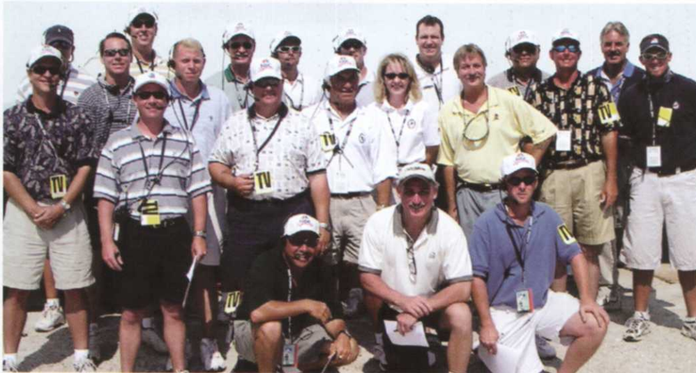
The Palm Beach Chapter continues to earn scholarship and research funds by working as NBC Sports spotters at the Honda Classic, which was played this year at a new site, the Mirasol CC.

to the group and also recounted the day he spent with President Bush on Air Force One. That day was Sept. 11, 2001. It was an unbelievable insider's look of that infamous and historic day.